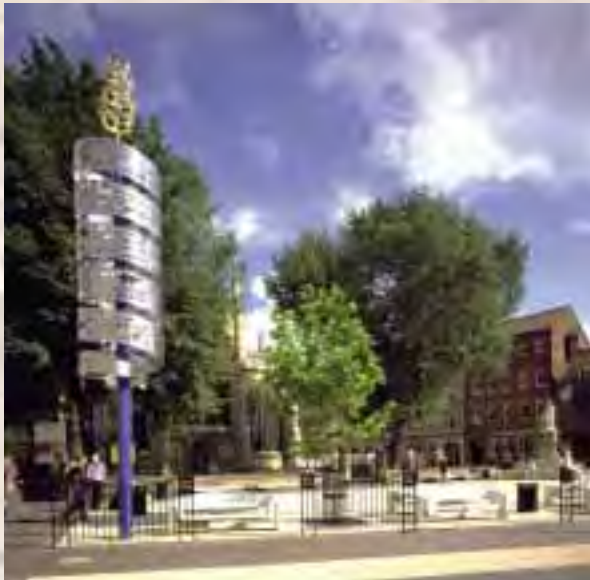
Trinity Square, Hull. Trees are a vital component in our public spaces and urban centres.