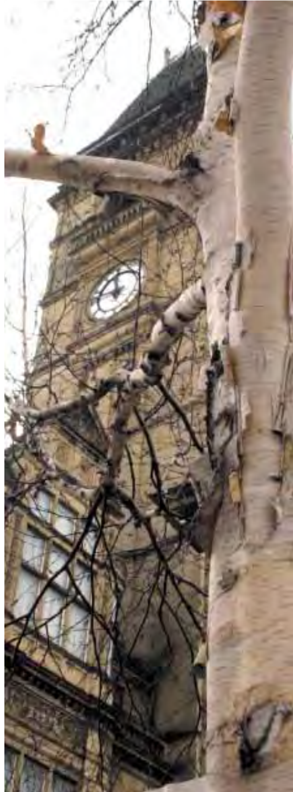
THE WAKEFIELD DISTRICT REACT PROGRAMME

The natural environment is also important because it provides the setting for leisure activities and tourism. As well as helping to define some of our more attractive landscapes, woodlands also have the capacity to accommodate significant numbers of people without appearing crowded, and to host adventurous and sometimes noisy sports without impacting unduly on the wider landscape. There are also good examples in the region of woodland management to support leisure and tourism objectives. The redevelopment of the Forestry Commission's Keldy Cabin complex in North Yorkshire, and the proposed new visitor centre, car parking and cycle trails at Dalby Forest represent a projected investment of over £9m. This level of investment is based on income from tourism now running at more than £1 m a year from the North York Moors Forest District, in excess of that derived from timber sales.