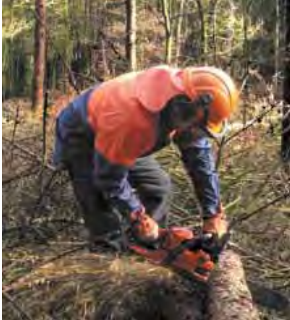
THE WAKEFIELD DISTRICT REACT PROGRAMME