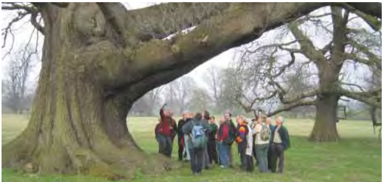
A meeting of the Ancient Tree Forum discusses the importance and future management of one of the Ancient Trees at Studley Royal, a World Heritage Site.

Advocating a change in the way the region values its trees and woodlands can be successful if we can win broad support amongst the public. Most people already have a close affinity with trees. This strategy seeks to convert this affinity into a strong groundswell of support for a change in the way the future of our trees and woodlands is prioritised.