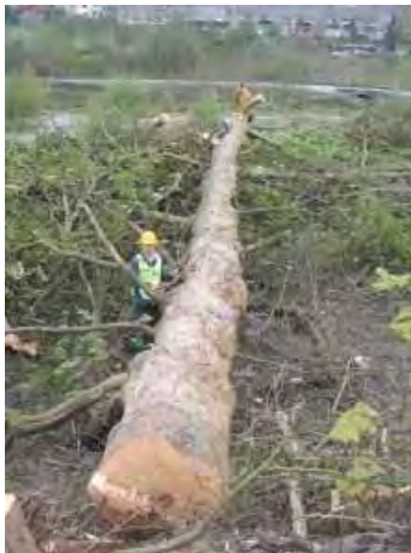
Illegal felling in West Yorkshire. We continue to lose mature trees to new development, sometimes despite legal protection.