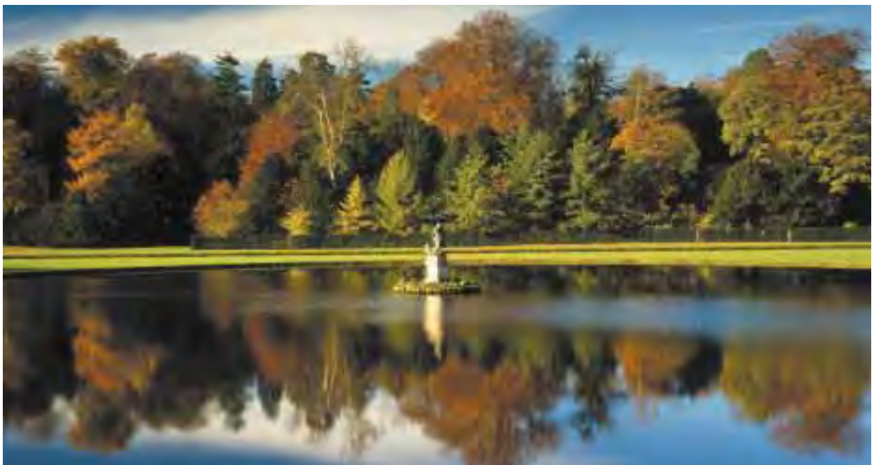
These woodlands near Ripon provide part of the setting for a magnificent designed landscape which includes the 17th century Studley Royal Deer Park and 18th century Water Gardens. Originally part of the managed lands around Fountains Abbey which was founded in 1132, the two sites together are owned and managed by the National Trust and were designated as a World Heritage Site in 1987. Attracting over 300,000 visitors a year, they are one of the Trust's most visited properties in the country.

Guiding Principle 4 – design and implementation of all new tree and woodland planting or management schemes will adhere to published industry best practice.