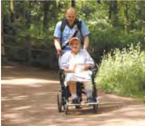
Woodland walk at Newmillerdam Country Park, Wakefield