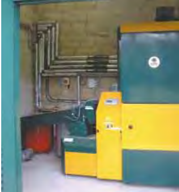
FORESTRY COMMISSION: CRISPIN THORN