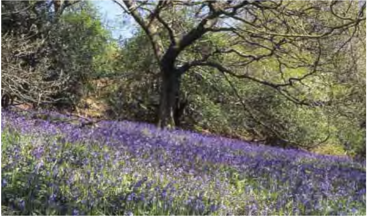
NORTH YORK MOORS NATIONAL PARK