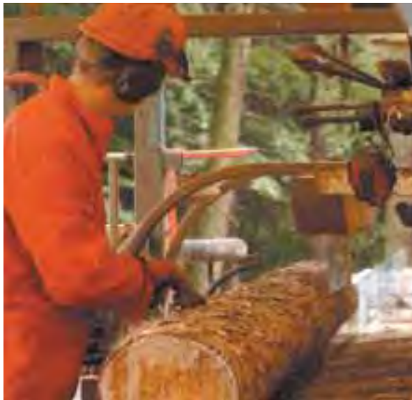
Softwood processing at Deffer Wood in Kirklees, West Yorkshire. Small scale sawmilling still provides an important source of income and employment in some parts of the region.