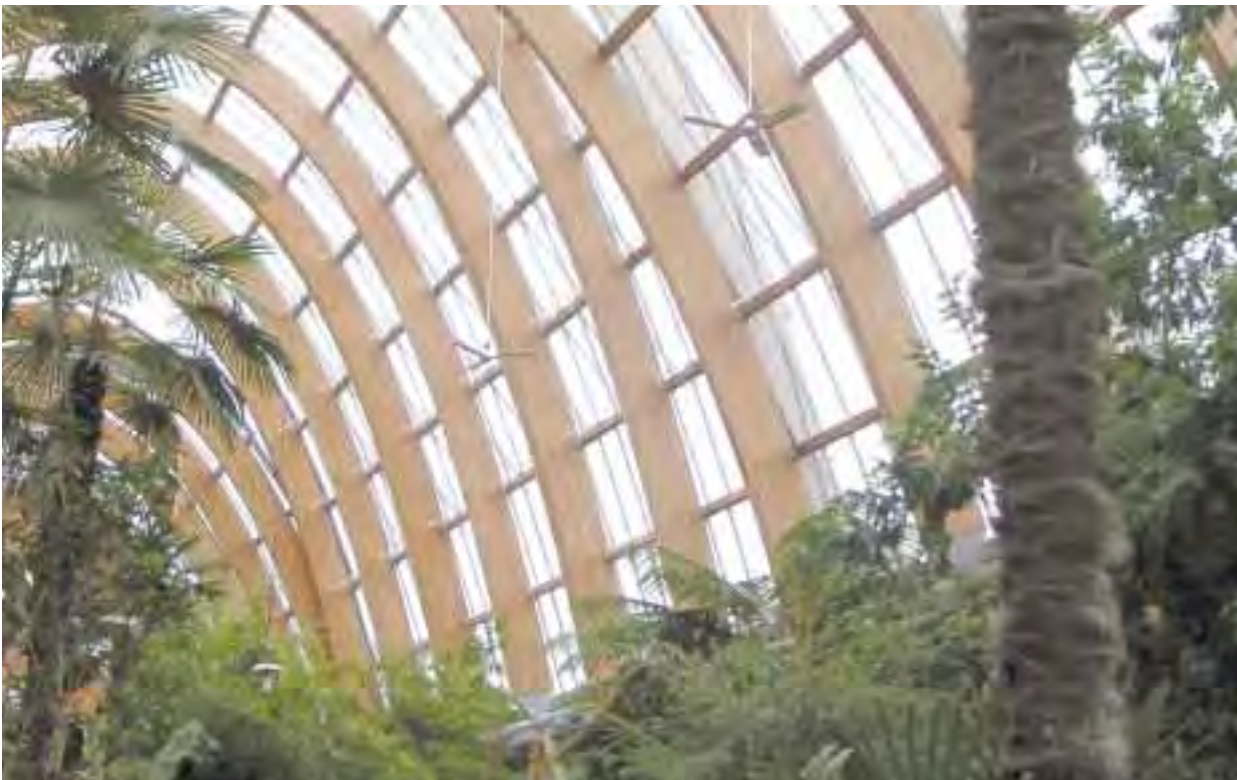
The Winter Gardens, Sheffield. The use of timber in construction is increasing and can make a dramatic visual impact.

There is also a small but growing market for other non-timber products from our woodlands, including charcoal, foliage and food products.