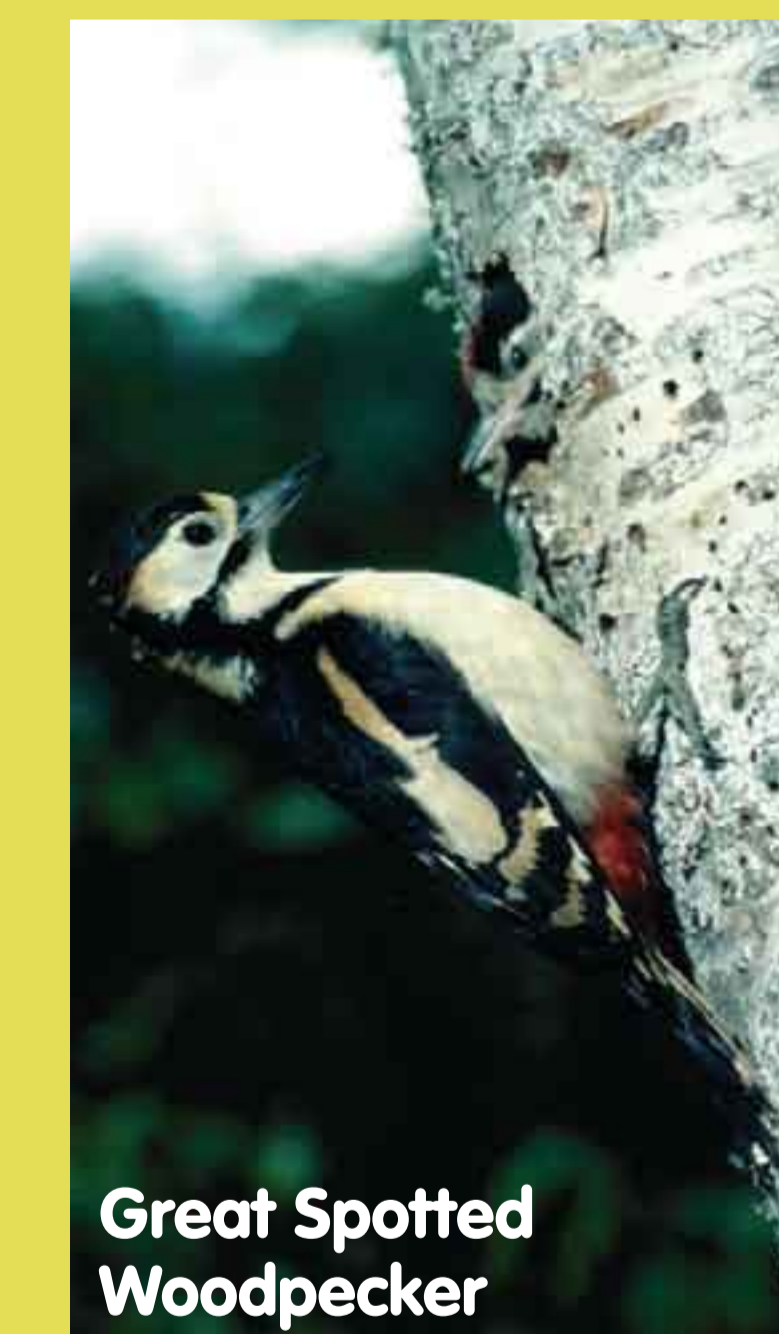
Great Spotted Woodpecker

Listen out for the woodpeckers that live high in the trees. Did you know that woodpeckers have some of the longest tongues in the bird world? They use them to grub out invertebrates from the holes they drill in the tree trunks.