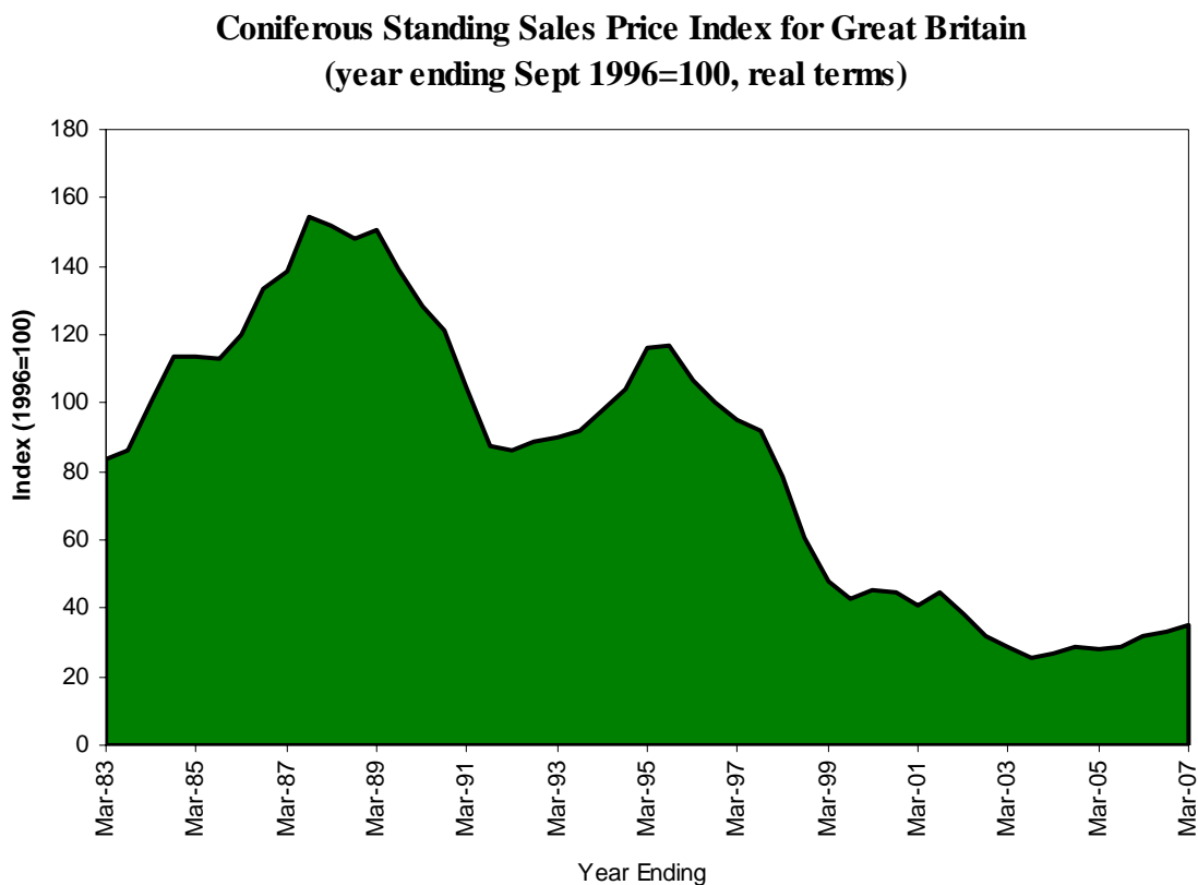
Chart 1: Coniferous Standing Sales Price Index for Great Britain

Note: Chart 1 illustrates the aggregate trend of prices received for all conifers sold standing on the Forestry Commission estate. Interpretation should be on that basis only. The Index does not show end product price changes nor local trends, conditions or prices and cannot be interpreted on that basis.