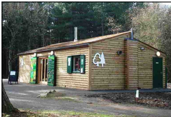
Above: A similar type café building on another Forestry Commission site.

Further details including a FAQ sheet can be found at www.forestry.gov.uk/jeskyns .