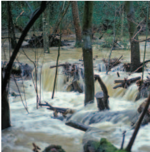
Woodlands can benefit areas at risk of flooding.

Our research into soil science and forest hydrology forms the basis of an understanding of forest sustainability and the interactions of forests with the wider environment. We have an increasing interest in the carbon dynamics of forests and forest soils, and determining the effects of atmospheric pollution remains an important element of our work.