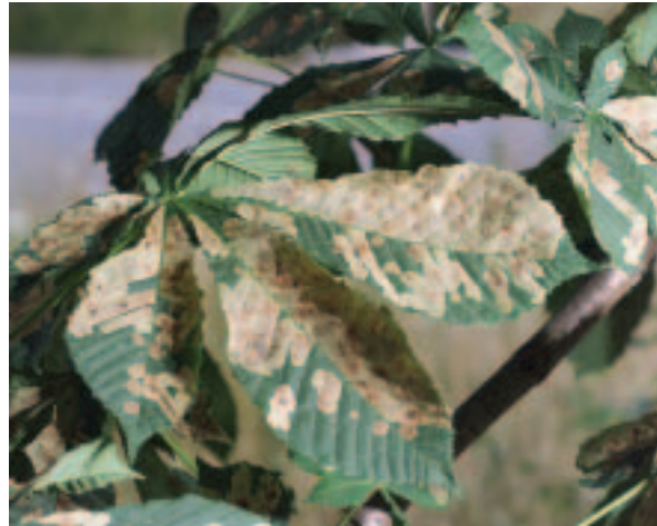
Horse chestnut leaf miner is just one disease being studied.