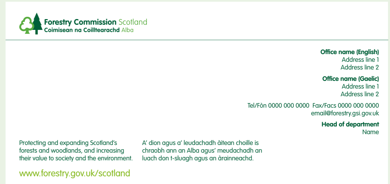
Forestry Commission Scotland (gaelic version)