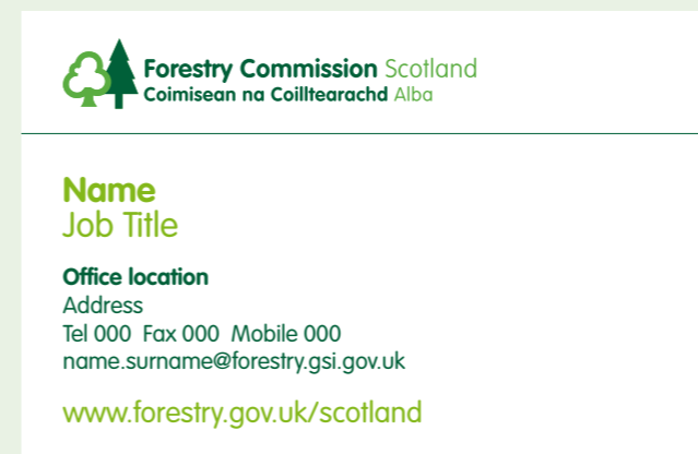
Gaelic version back