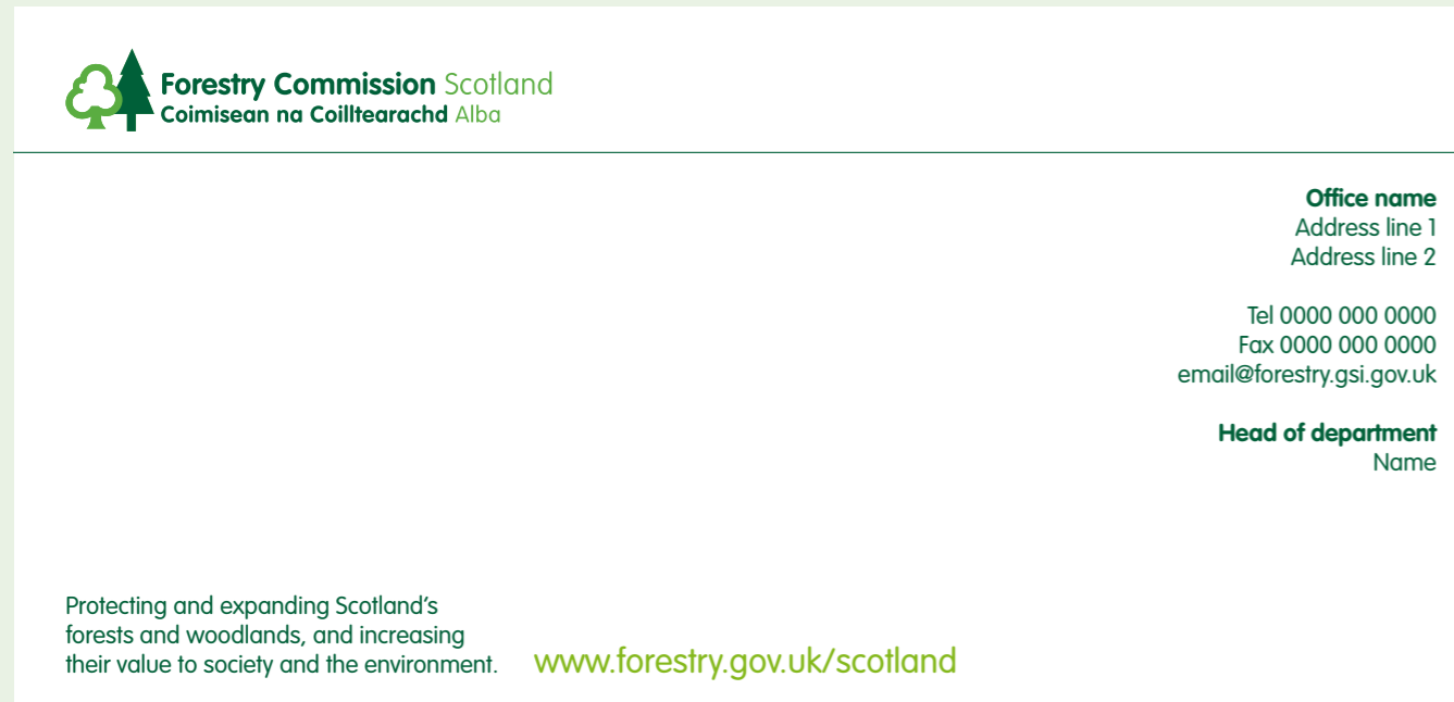
Forestry Commission Scotland