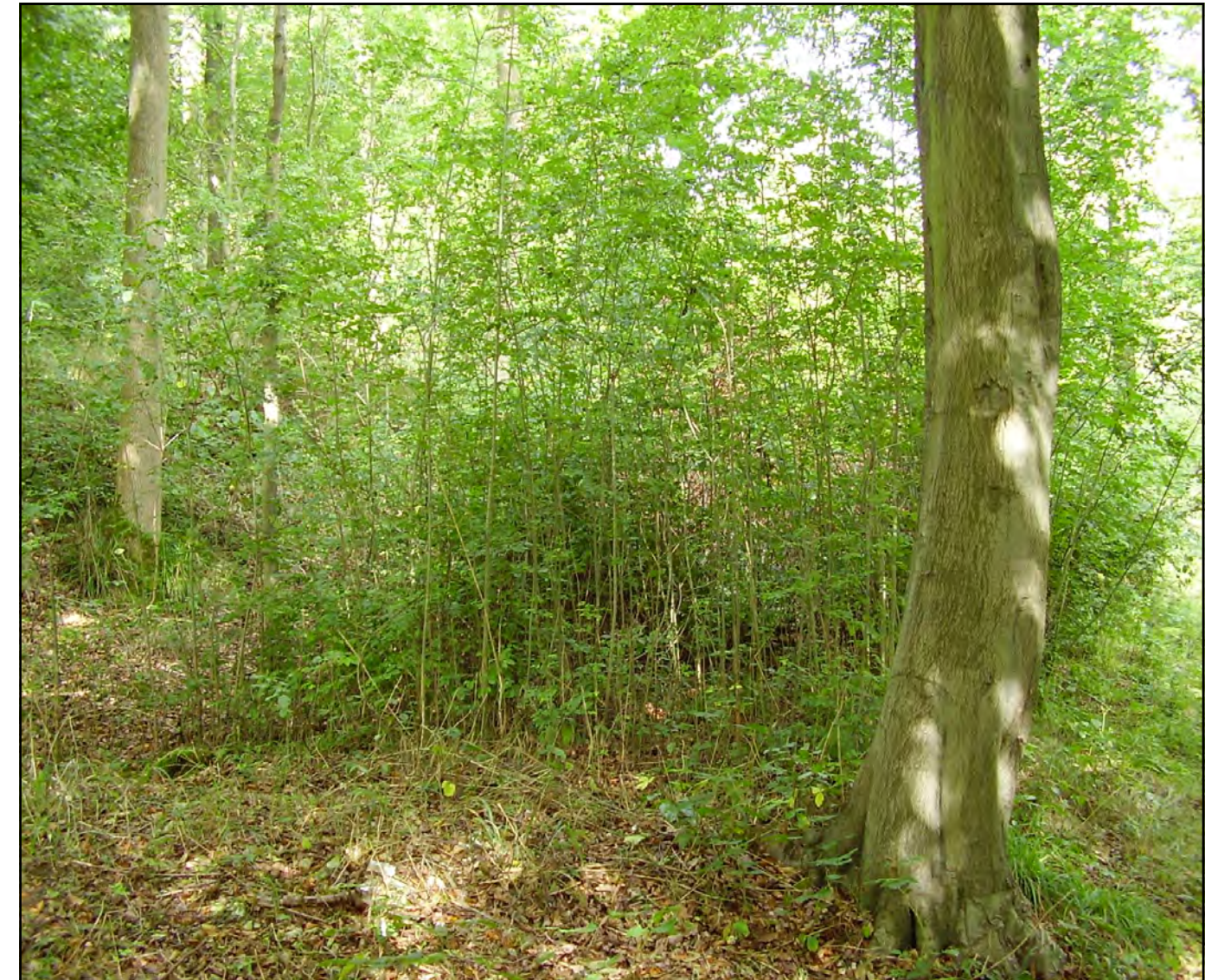
Natural regeneration of ash on an ancient woodland site managed under a continuous cover silvicultural system

Since this plan was started, the ETWF has been replaced by the government's response to the Independent Panel on Forestry. The age structure in the South Downs is rather narrow but there are good levels of broadleaved regeneration where deer numbers are controlled and there is sufficient light reaching the forest floor. The employment of silvicultural systems which maintain woodland cover will gradually extend the age range and increase diversity across all of the Downs woods. This results in a more attractive woodland for visitors and a range of niche habitats for a wide range of species. And of course, a steady stream of utilisable timber provides security for those employed in the timber industry.