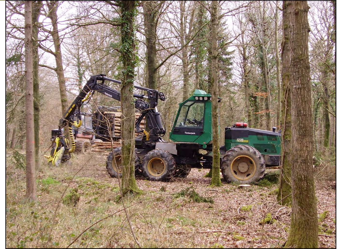
Harvester used to thin in broadleaved woodland (FC picture)