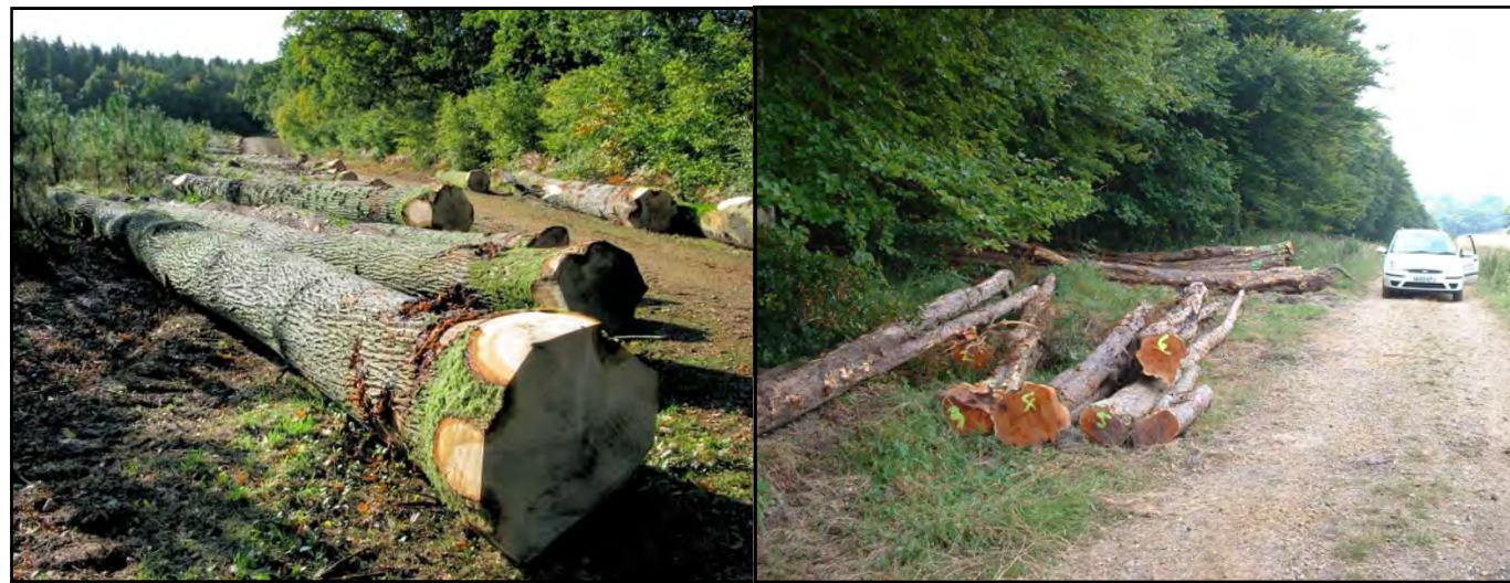
Quality oak and yew logs

The income derived from timber harvesting operations helps to support the other management activities in the Downs woods. Overall, timber related activity will generate employment for about 12 people.