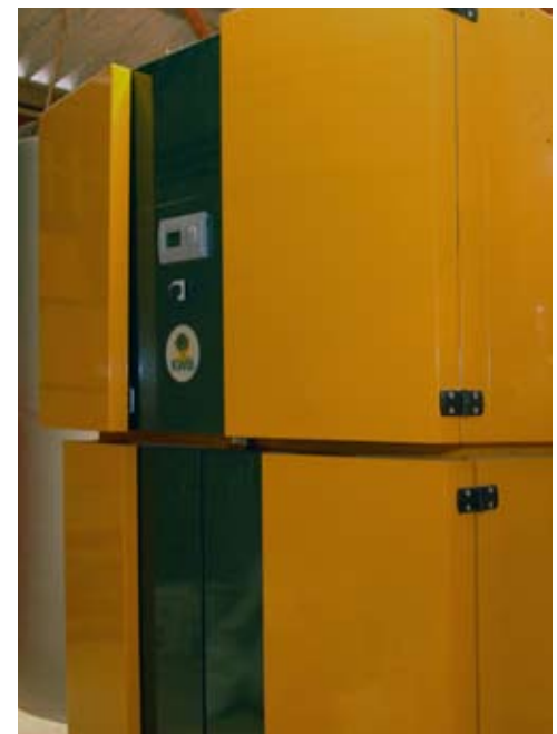
Woodfuel boiler. 150kW. Torry Hill estate, Kent

For further information on woodfuel related grants, see the grants section of the EU funded project WoodHeat Solutions website .