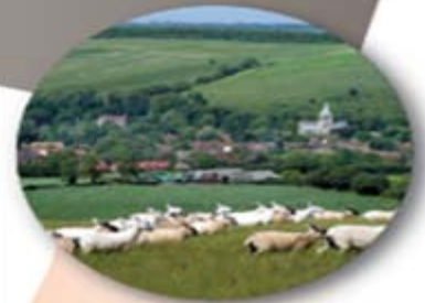
Landscapes and places

Ecosystem services: eg food, timber, water, well-being