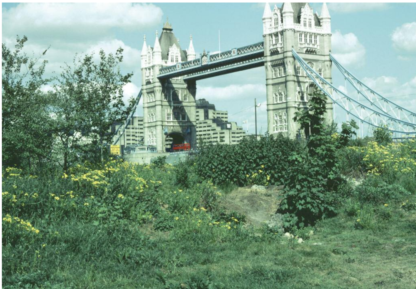
Figure 2 The William Curtis Ecological Park in the heart of London, photographed in 1982.

continue to rise, although the rate and extent of this will depend on many factors. Trees that previously thrived in urban areas may start to decline and better adapted species of trees will have to be planted. Recent research has shown that trees can play a vital role in urban climate adaptation, with the larger-growing tree species providing significantly greater benefits for urban cooling (Ennos, 2010). The choice of species to meet this requirement, and still survive in demanding urban locations, will over-ride any considerations about native or non-native species.