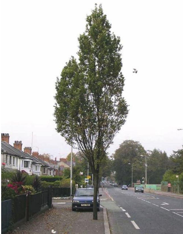
Figure 1 A fastigiate oak used as a street tree.

One of the most common arguments in favour of selecting native trees for urban areas is their conservation value in encouraging associated wildlife. Conservationists are often keen to quote data in support of this. The statement that an oak tree can support over 400 species of invertebrates frequently appears in conservation literature (Alexander et al. , 2006) and in some BAPs (Rushmore Borough Council, 2009) and LA tree strategies, even for urban areas (Manchester City Council, 2006). However, conservationists themselves recognise that no one tree on one site supports this number and a wide range of factors can influence any tree's ability to realise its conservation potential (Alexander et al. , 2006). While the conservation value of many of our native trees may be significant in urban woodland, most of our urban forest is comprised of individual and small groups of trees in close proximity to buildings, streets, traffic, utility services, etc. An oak in a busy city centre street with paved surfaces, high levels of pollution and poor soil conditions will support a very limited number of species of invertebrates.