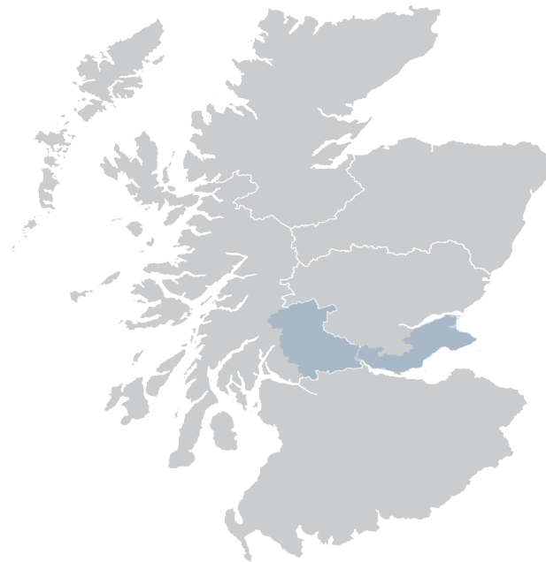
Map 1 Stirling, Fife and Clackmannanshire

© Crown copyright and database right [2014]. All rights reserved. Ordnance Survey Licence number [100021242]