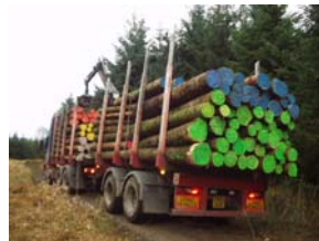
Logs from a research experiment being transported to sawmill

The seminar is for all those involved or with an interest in the forestry and wood processing industries. It is particularly aimed at informing the industrial sector of the latest research on wood and timber.