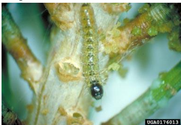
Figure 2 – T. pityocampa first instar larvae.

nose-to-tail processions, and when fully developed they can measure approximately 40mm long. From the third instar, larvae develop urticating setae (hairs) which can cause symptoms varying from itching skin rashes and eye irritations to severe allergic reactions in humans and other animals, including dogs.