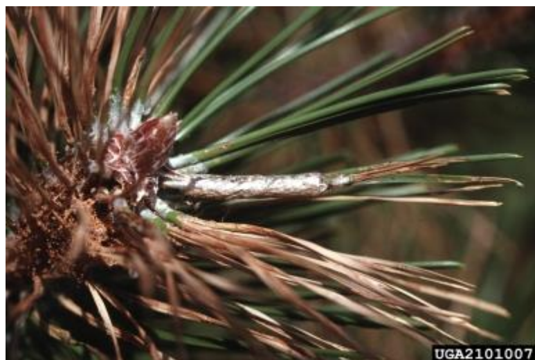
Figure 1 – Egg mass of T. pityocampa .

The four life stages of T. pityocampa are eggs, larvae, pupae and adults. Eggs are usually less than 1mm long, orange coloured, laid in batches of 150-350 on pine needles or twigs, and covered with scales produced by the female (Figure 1).