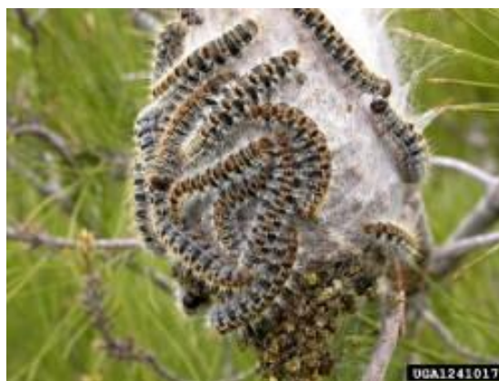
Figure 3 – T. pityocampa later instar larval stages.

The larvae feed through the winter months, provided the temperature is above 0°C, and build silken tents (resembling cotton wool) for protection, usually towards the top of the tree canopy (Figure 4). They tend to feed on the needles during the night, and rest in the tents by day. Clumps of frass often gather at the bottom of the nests.