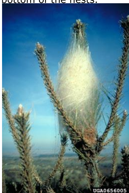
Figure 3 – T. pityocampa larvae nests.

The larvae feed through the winter months, provided the temperature is above 0°C, and build silken tents (resembling cotton wool) for protection, usually towards the top of the tree canopy (Figure 4). They tend to feed on the needles during the night, and rest in the tents by day. Clumps of frass often gather at the bottom of the nests.