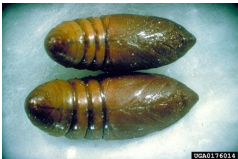
Figure 4 – T. pityocampa pupae.

Typically between February and May, the mature larvae descend the host tree in a characteristic head-to-tail procession and dig into the soil to a depth of 5-20cm where they subsequently spin cocoons. The cocoons are oval in shape, up to 20mm long, and chocolate brown in colour. The pupa, or chrysalis( Figure 4) forms within the cocoons. Depending on temperature, the pupae remain in the soil until June to September, when the moths emerge. However, a proportion of the pupae will enter a prolonged diapause, which in some circumstances can extend over many years.