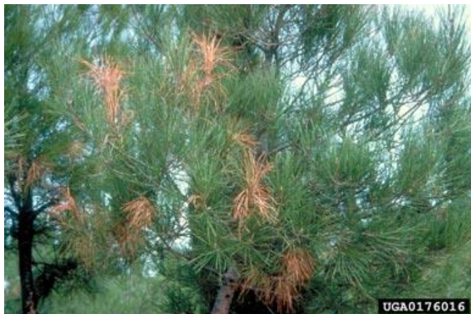
Figure 8 – typical defoliation damage caused by T. pityocampa : Source D.D. Cadahia, Subdirección General de Sanidad Vegetal

Additionally, social impacts are caused by the urticating hairs of the older larvae which become detached from the larvae and contaminate the environment more widely. If they come into contact with skin, these setae cause severe rashes in both humans and other mammals due to a toxic protein they contain. If airborne setae are inhaled, they may cause breathing difficulties, e.g. asthma. If the setae enter the eye, severe corneal inflammation can occur (Portero et al. , 2012). The larval nest also contains shed hairs that continue to pose a risk to those that handle it for months or even years afterwards (Arditti et al. 1988).