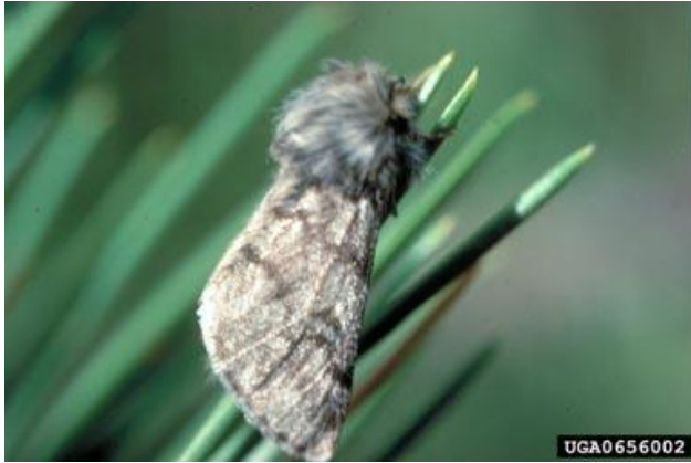
Figure 6 – Adult T. pityocampa .