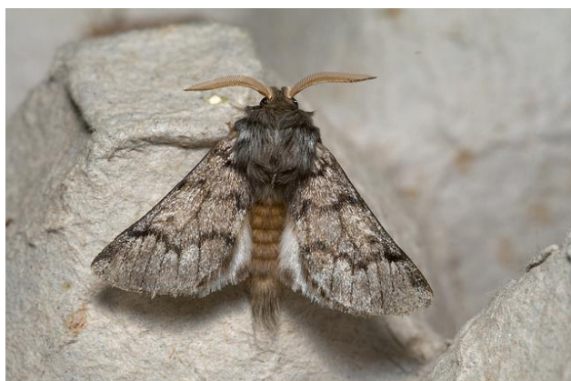
Figure 5 – Adult T. pityocampa .