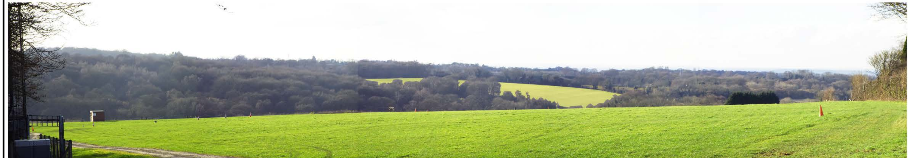
In the 60% Woodland Cover scenario there is little change in this view. The farther field has been given over to a mix of natural regeneration and open space, but this change is mostly eclipsed by the hedgerow.