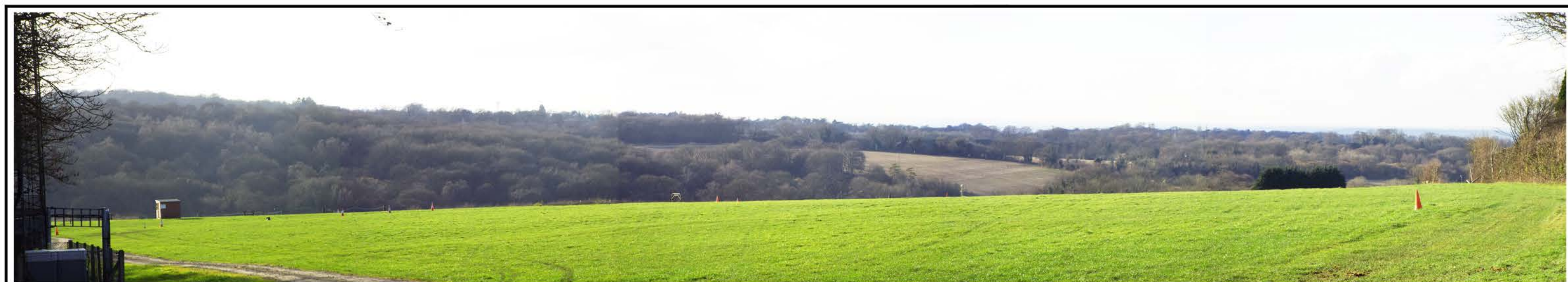
Existing Landscape : This view is dominated by the mass of Great Hurst Wood rising on the far side of the valley. The open fields beyond rise up to the M25 motorway. A pylon can be seen standing in the valley.