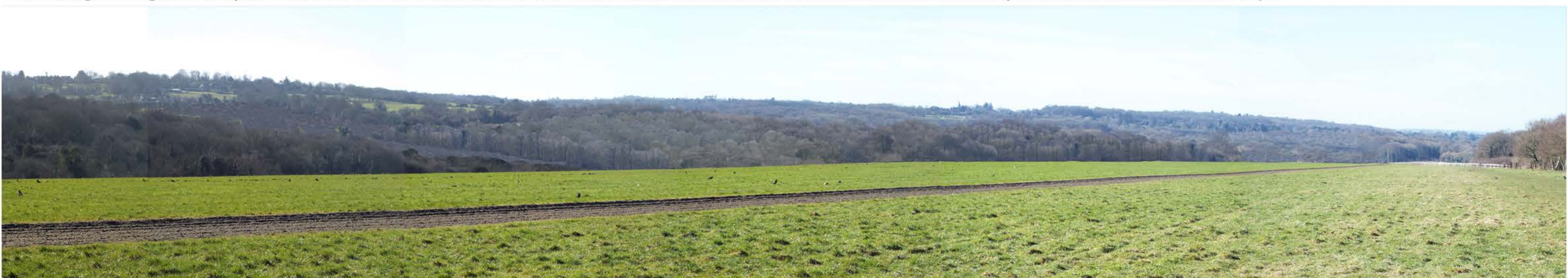
100% Woodland Cover gives an attractive wooded landscape from this perspective. The low rolling land form continues to provide visual interest and breaks up the treescape into visual islands.