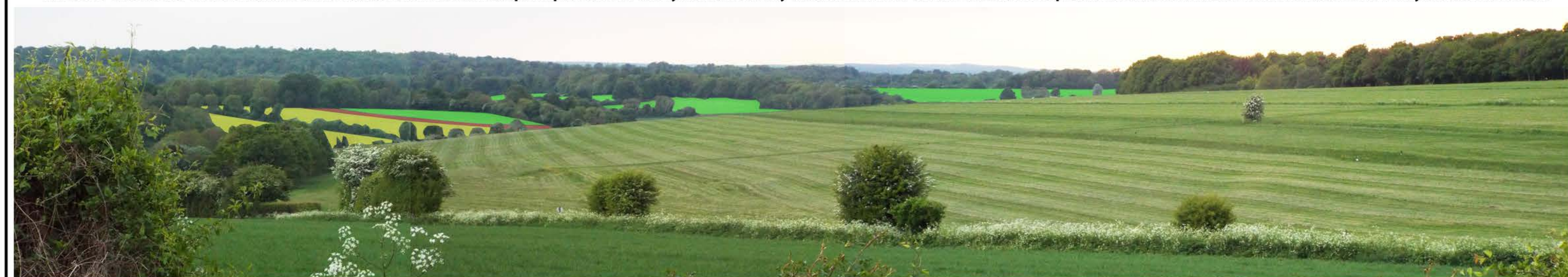
The 70% Woodland Cover scenario shows the fields above Nohome Farm planted with woodland in the far distance. The retained open space is not visible because of the landform of Walton Down.