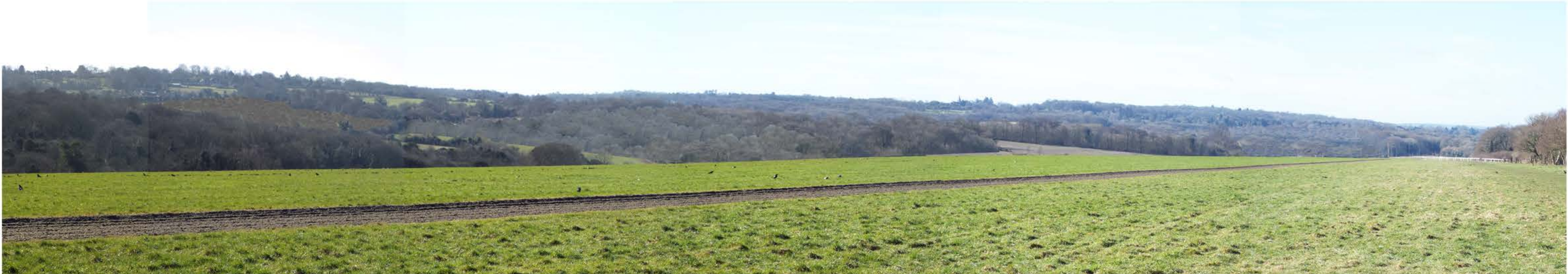
With 60% Woodland Cover this landscape seen from VR5 does not look vastly different from its existing state of 10% woodland cover. There are no vantage points from which to obtain more elevated views.