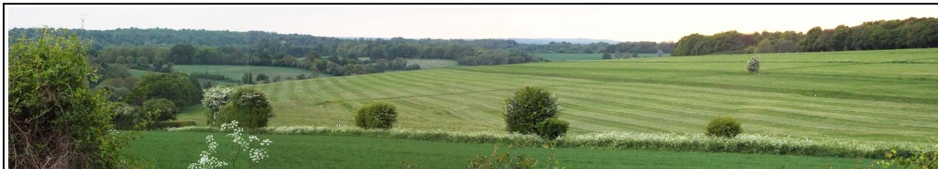
Existing Landscape : This view is representative of three or four glimpsed views that can be observed through gaps in the hedge along Epsom Lane North. At the left, the normal hedge height can be seen.