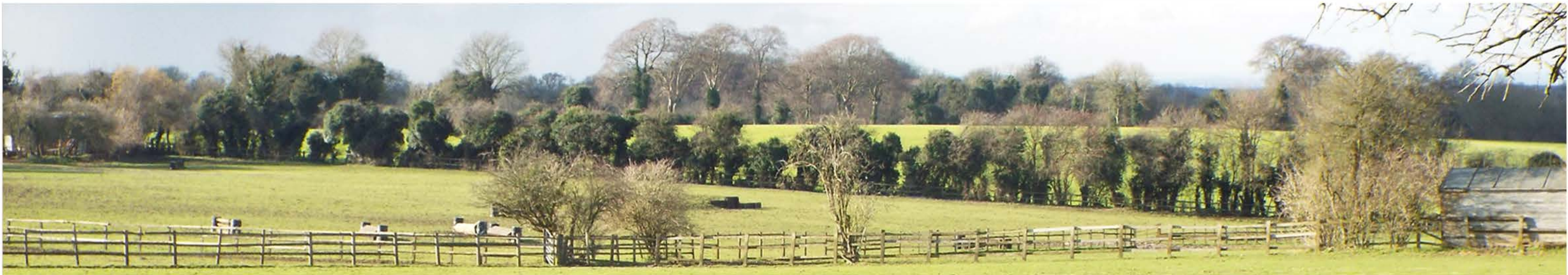
VR 17 : A small depression or vale on the edge of Tadworth prevents views into the Langley Bottom Farm landscape. Horsey-culture is the predominant land use throughout this sururban edge landscape.