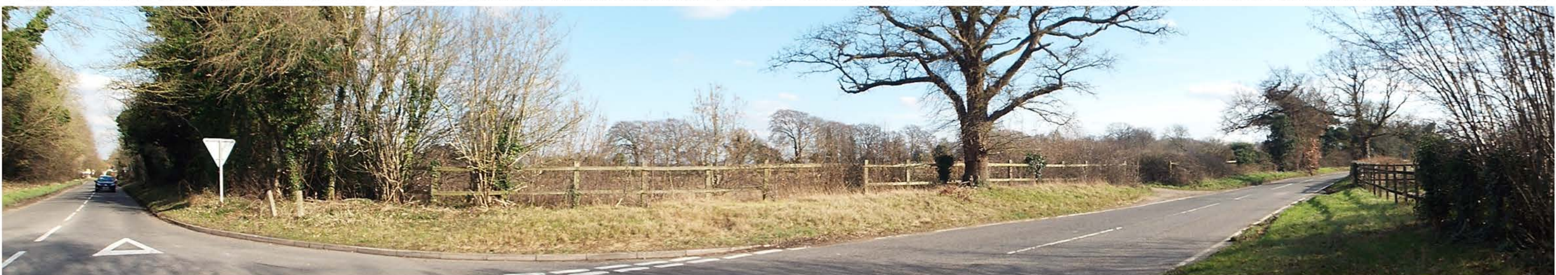
VR 25 : This corner is the south-western extent of the site. This VR location is the highest point in the landscape, but the plateau atop the ridge and the well treed hedgerows prevent any far distant views.