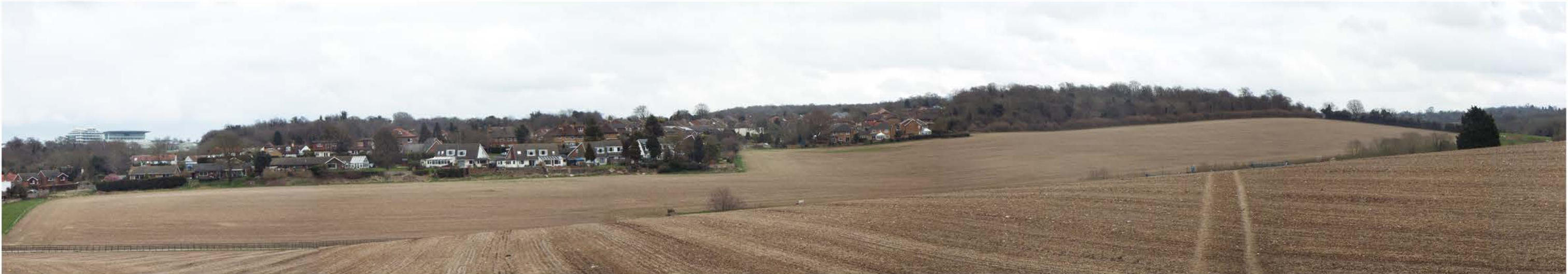
VR 28 : This view from the pedestrian crossing on Langley Vale Road will be obscured by the natural regeneration of the near hillside. The view will be delayed until walkers reach the edge of the new woodland.