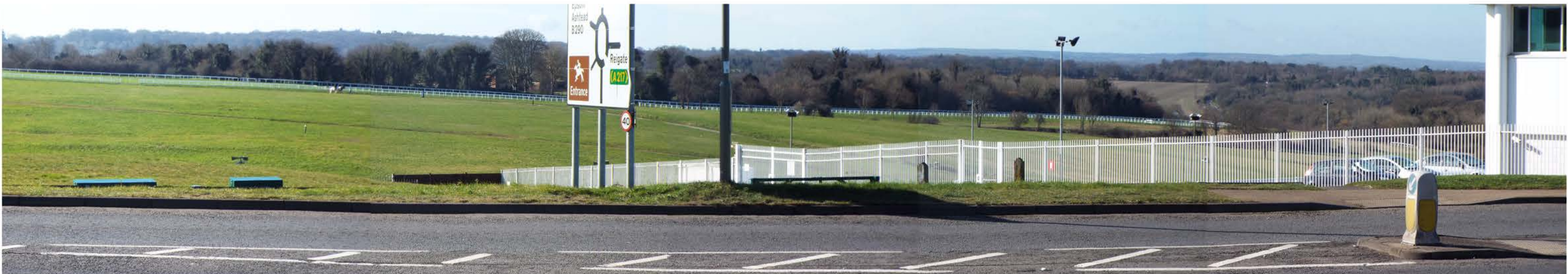
VR 35 : This is the most prominent view of the woodland site from the main road across the Downs. Even here only a glimpse can be seen. Most of the site is obscured by existing woodland in front of The Warren.