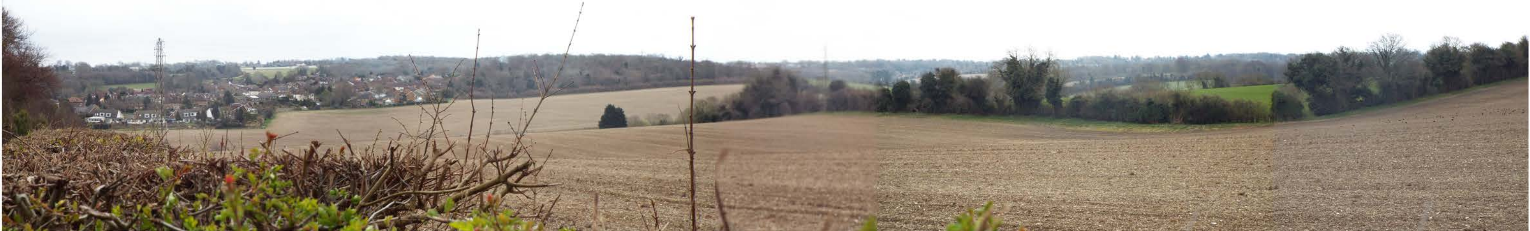
VR 27 : This view will be fully occluded when the natural regeneration in the nearest field grows up. Extension growth in the foreground shows that this view is only seasonally available when the hedge is cut low.