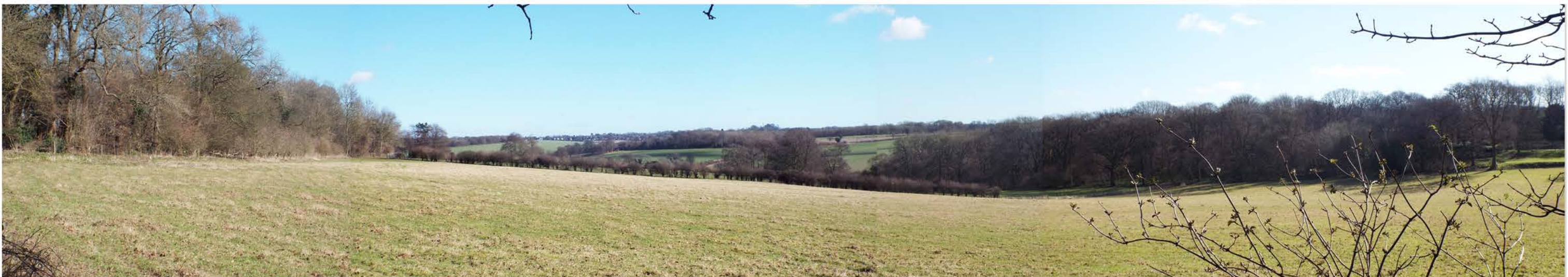
VR 23 : View from a gateway on Hurst Lane into the centre of the site. Most views from the lane are filtered through dense hedgerows and trees. This view will be occluded in the middle distance by new planting.