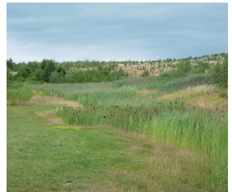
Figure 1 Restored sites often require cultivation prior to vegetation establishment.