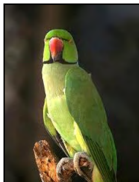
Above: Rose-ringed parakeet

Six new species were also recorded: Yellow Hammer, Reed Bunting, Meadow Pipit, Mallard, Little Grebe, Eurasian Sparrowhawk and Rose-ringed Parakeet.