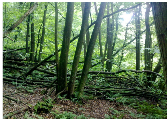
A target for Good Woods - neglected ancient woodland in Surrey

In England alone, around 47% of woodlands are considered either un-managed or under-managed. Bringing these woodlands back into good condition through sustainable woodland management will be integral to growing a new 'wood culture' , providing more jobs in the forestry sector, improving woodland habitats for nature and creating more places for people to exercise and enjoy the countryside.