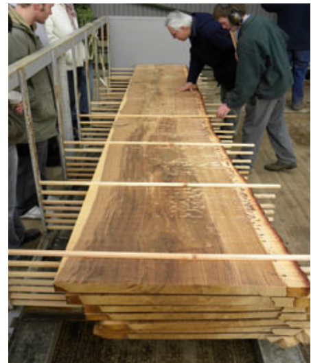
Woodland owner guidance - Assessing the volume and quality of timber in an oak tree

Good Woods provides a scalable model for targeting support to UK woodlands. This approach is coupled with a vision for strengthening the national supply chain to bring more responsibly produced, home-grown timber into our homes and workplaces. The ultimate aim of Good Woods is to invigorate the current generations' appreciation of trees and woods and realise the potential that British woodlands can play in all of our lives, both now and in the future.