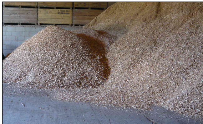
Wood chip store

Good communication between boiler installer, fuel supplier and end user during planning and installation is critical to ensure smooth day to day functioning of wood-fuelled boilers. Three main issues that need consideration during the planning stages are: