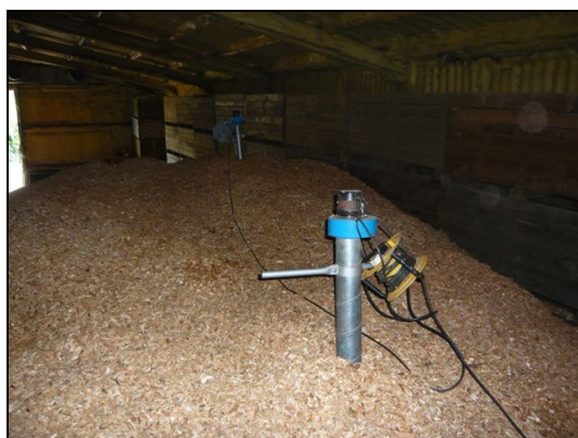
Grain spear used to control hot spots

As the current value of woodchips is relatively low, well planned logistics are required to keep transport and handling costs to a minimum and to ensure equipment used in the supply chain is used most efficiently. The key points identified were: