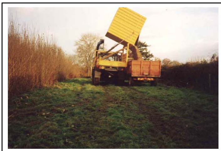
Salix Maskiner MkIII on JCB Fastrac Box