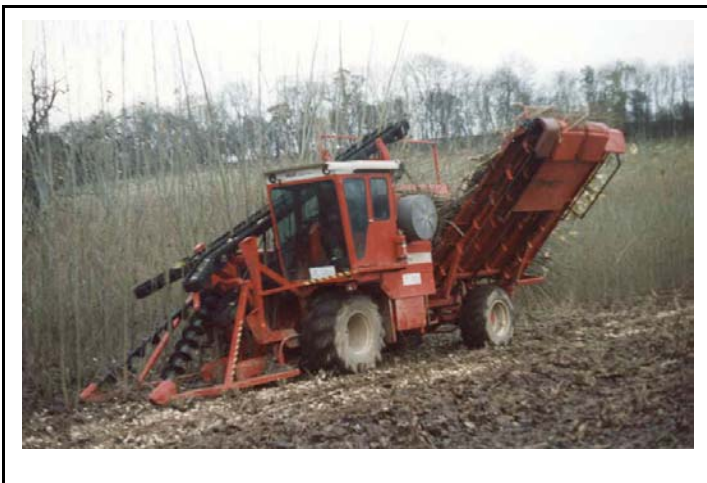
Seggerslaat Empire 2000 Stick Harvester

The harvesting trials covered a wide range of sites and crop types ranging from willow at Castle Archdale, in Northern Ireland, to poplar at Buckfast, in Devon and Ashmans Farm in Essex. Different methods and systems were tested and refined in order to find the most appropriate machines, methods and systems for UK conditions (Table 1).