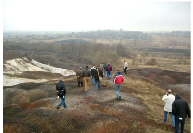
SENSOR partners inspect former mine site in Silesia