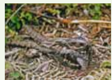
Right: Nightjar on nest