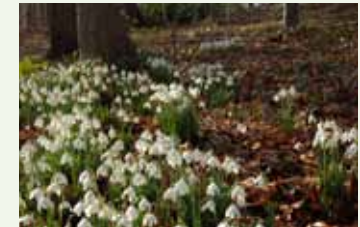
Top: Snowdrops at Santon Downham

Interesting information on the history and wildlife of this area can be found on eight panels around the walk. The walk can be started from St Helen's Picnic Site or Santon Downham. The easy access trail at St Helen's Picnic Site is one and a half miles long and follows the river for part of its route. It is suitable for wheelchairs and buggies.