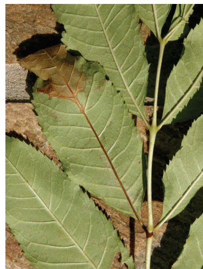
Chalara dieback of ash - browning of ash leaf tip caused by Chalara fraxinea fungus

which have been planted during the past five or so years. Make yourself familiar with the symptoms of Chalara dieback from the material on our website . There are other causes of ash dieback, so it is important to distinguish them from Chalara, however, if in doubt, report it.