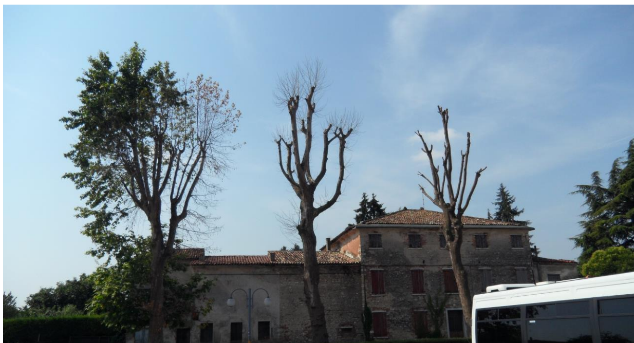
Figure 5- Gradual progression of infection caused by C platani