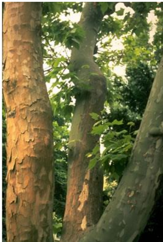
Figure 3 – Invasion of bark on tree stems C. platani .