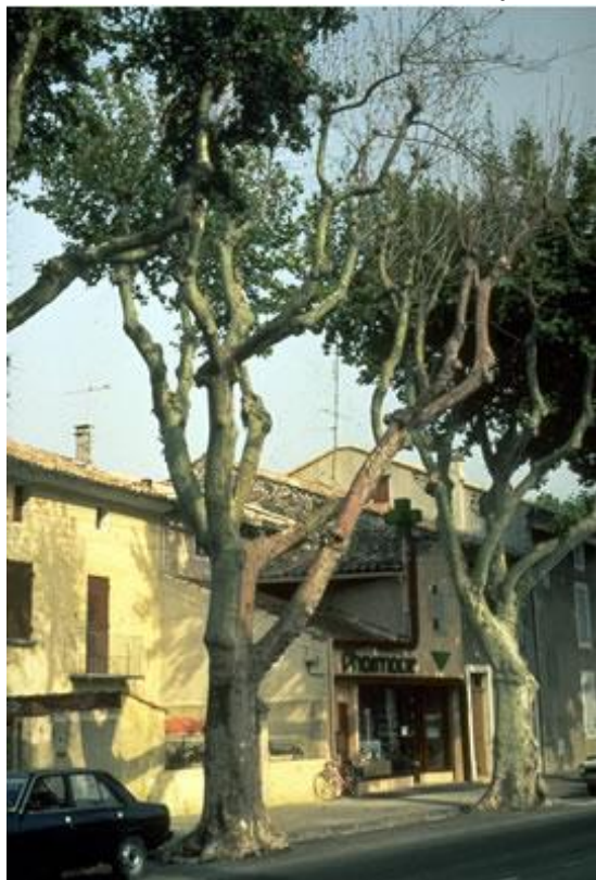
Figure 2 – Advanced symptoms such as canopy thinning caused by C. platani .

The FC Pest Alert factsheet provides further details of symptoms of the disease.