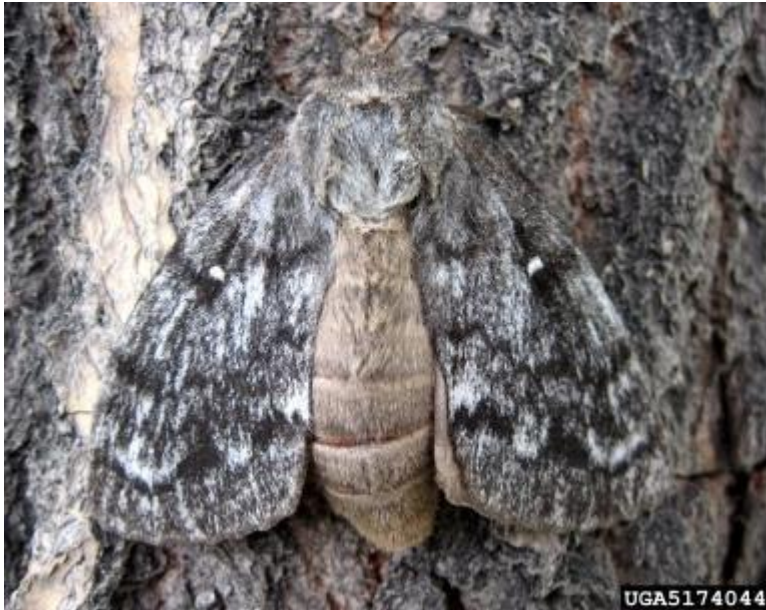
Figure 4. Adult female D. sibiricus .

The male wingspan is 40-60mm, the female's 60-80mm, and sometimes up to 100mm. The front wings are brown-violet, with one characteristic white spot.