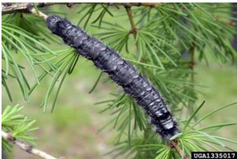
Figure 2. D. sibiricus larva.

The larva is 5-7mm long just after emergence, but just before pupation it is 50-80mm long.