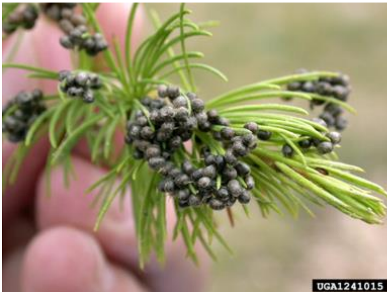
Figure 1. D. sibiricus eggs.

The eggs are brown-yellow-green. They are oval, about 0.5-0.6mm in length, and slightly flattened dorso-ventrally to about 1.5-2mm. They are laid in masses on branches, twigs and needles (Figure 1).