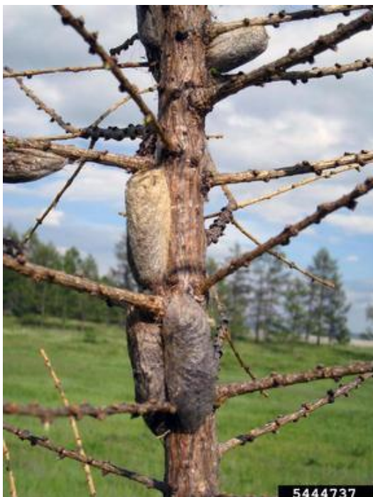
Figure 3. Cocoons of D. sibiricus .

When the larvae reach the final instar and feeding has stopped, they each spin a brown silken cocoon, 25-45mm long, in which to pupate. The cocoon is attached to the branches or trunk of the host. The pupation period is very long, lasting from May to July.