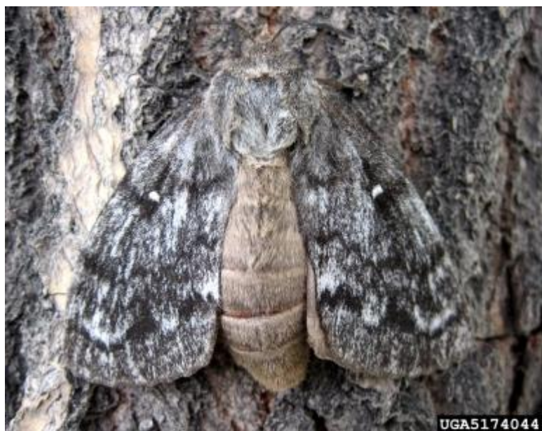
Figure 4. Adult female D. sibiricus .

The male wingspan is 40-60mm, the female's 60-80mm, and sometimes up to 100mm. The front wings are brown-violet, with one characteristic white spot.