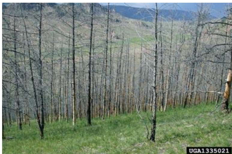
Figure 5. Extensive defoliation of larch caused by D. sibiricus .

Defoliation of Pinus , Larix , Abies or Picea spp. is usually spectacular.