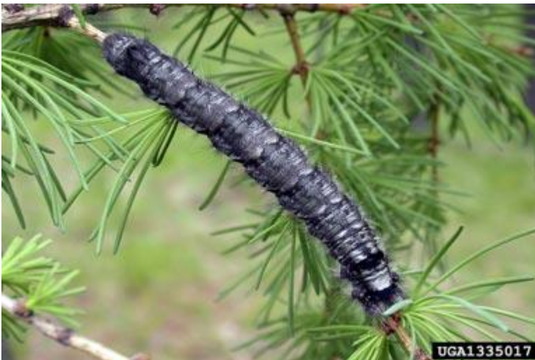
Figure 2. D. sibiricus larva.

The larva is 5-7mm long just after emergence, but just before pupation it is 50-80mm long.