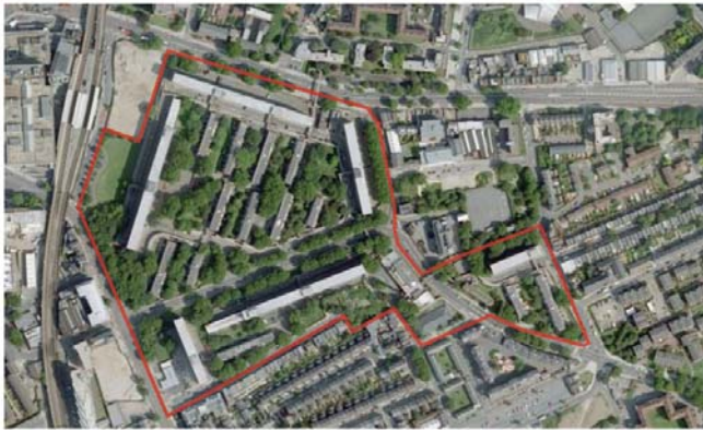
Heygate Estate's Secret Forest, a key image in the campaign.

The Forestbank will archive the story of this campaign and function as an educative, campaigning portal to secure commitments made here and expand from the site itself into central London's broader forest.