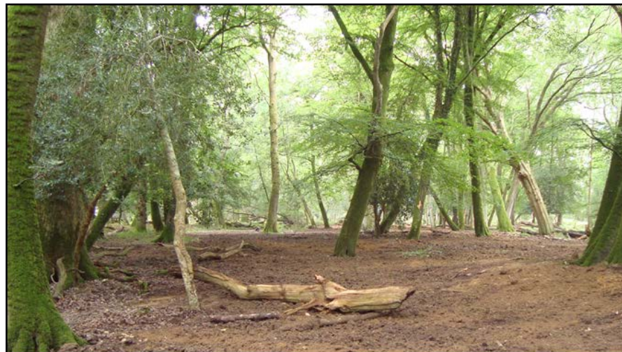
Artificial drain, after infill August 2012