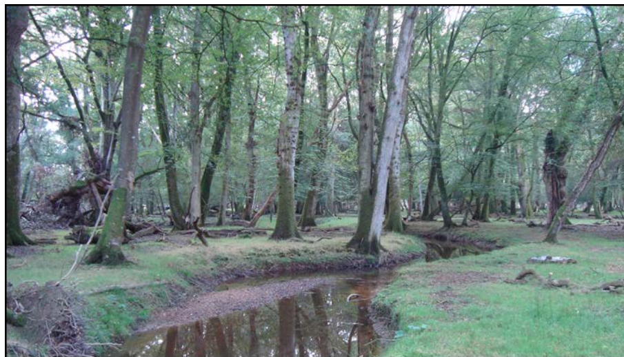
Meanders, after restoration October 2014