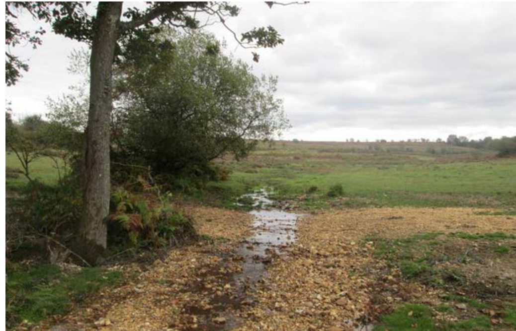
Picket Bottom, October 2014

Concrete bridge on open forest replaced with a gravel ford, bed level raised and channel narrowed