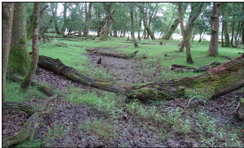
Meanders, before restoration July 2012