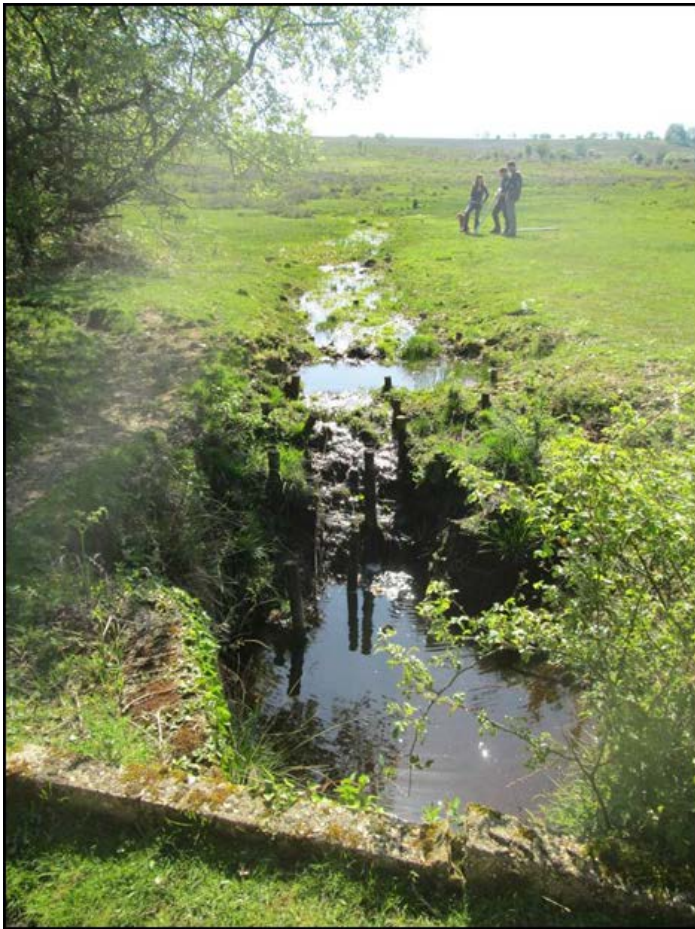
Picket Bottom, May 2014

Eroding end point of previous mire restoration taken from concrete bridge