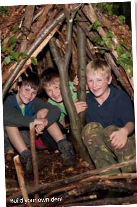
Build your own den!

Join us in the classroom to make a hanging willow bird feeder to encourage feathered friends into your garden. Open to adults too! Children should be accompanied and will need your help.