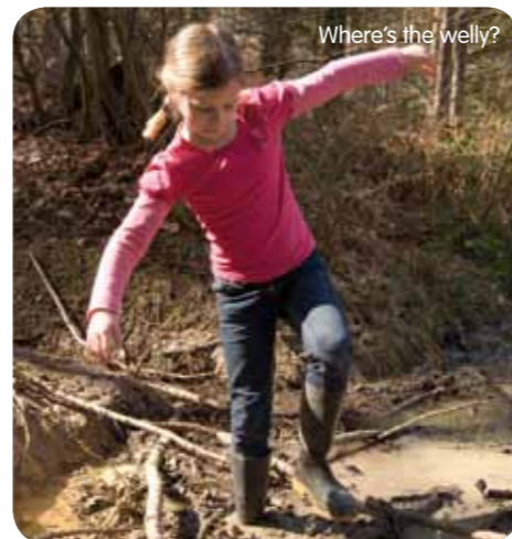
Where's the welly?

Booking is essential for all events and parking charges apply. Please park in the main car parks and walk to the classroom for your event unless otherwise stated. Children under 8 years must always be accompanied.