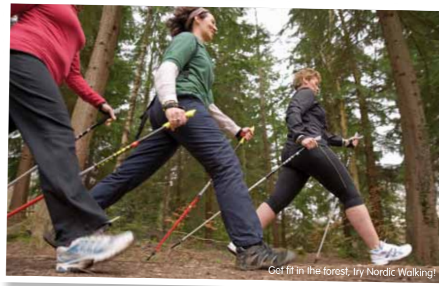
Get fit in the forest, try Nordic Walking!

In addition to school visits, group bookings and our own events, we run a number of more regular activities for children and adults.