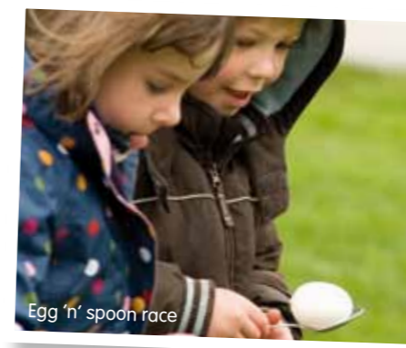
Egg 'n' spoon race