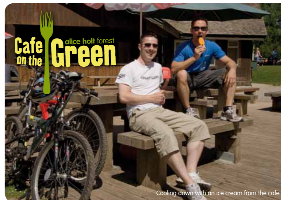
Cooling down with an ice cream from the cafe