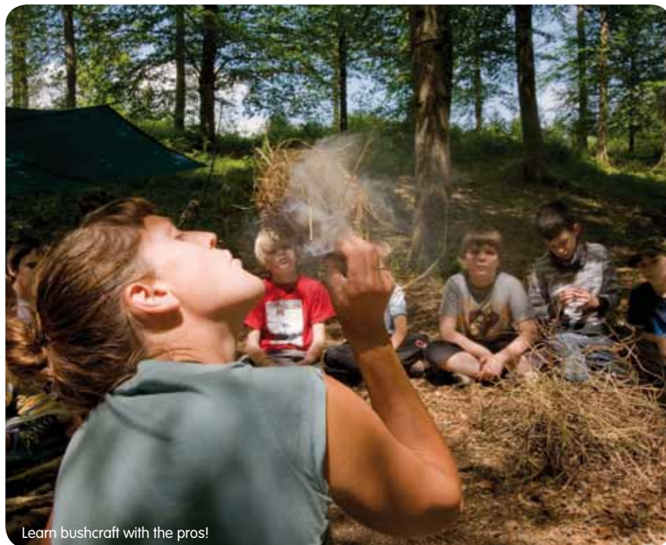
Learn bushcraft with the pros!