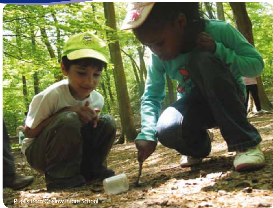
Pupils from Onslow Infant School.