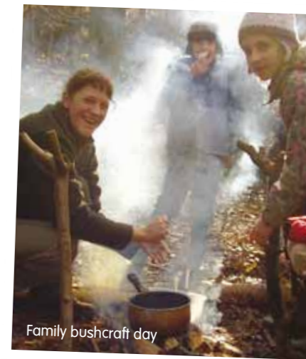
Family bushcraft day

Wands, wizard hats, jam jar lanterns and broomsticks will be amongst the craft offerings in the classroom.