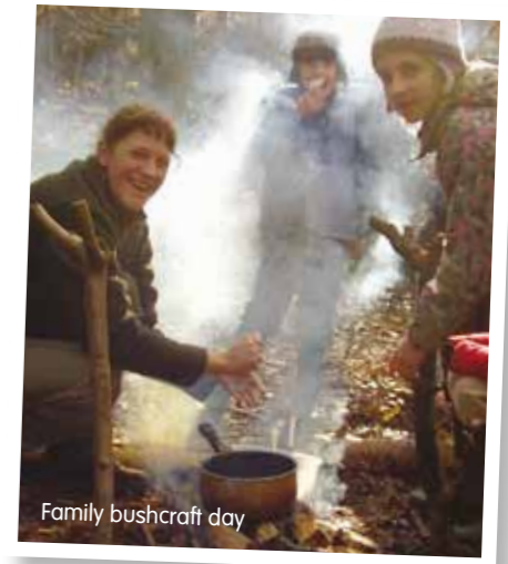
Family bushcraft day

Wands, wizard hats, jam jar lanterns and broomsticks will be amongst the craft offerings in the classroom.