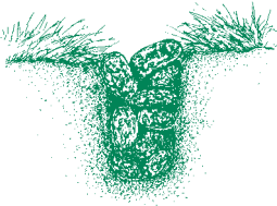
Cross section of a latrine pit.