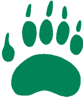
Right hind foot (half natural size).