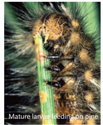
Mature larvae feeding on pine

This development stage ends in early spring, when soil temperatures reach 4–5°C. The larvae then return to the pine canopy and feed voraciously on old needles, with occasional buds, shoots and green bark. Fully grown larvae (50–80 mm long) are more active and may crawl several hundreds of metres before settling on a pupation site. It has been found that some populations take two years to complete development, with larvae overwintering twice.