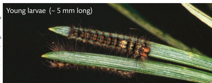
Young larvae (~ 5 mm long)

Eggs hatch after 16–25 days during August and September, and the larvae begin feeding on the edges of pine needles. Autumn feeding lasts for 2–3 moults until the first frost, when larvae migrate down the pine trunks and overwinter beneath the litter at the litter/ mineral soil interface, usually very close to the tree trunk.