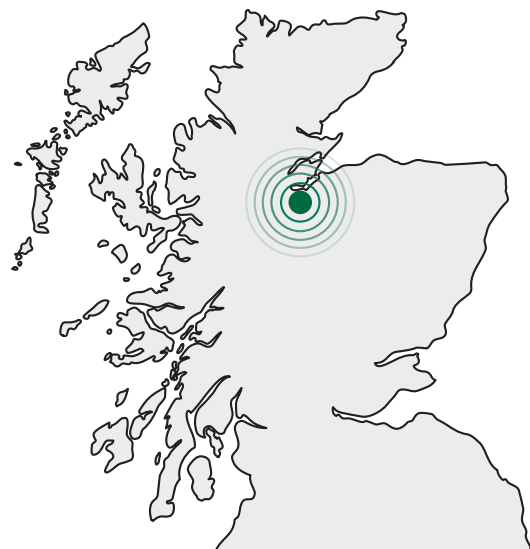
Area where moths have been captured

Although the pine-tree lappet moth is not subject to regulation under the European Plant Health Directive – as the pest is endemic in its native range in continental Europe – or listed in the Plant Health (Forestry) Order 2005, a containment and eradication programme has been launched using the general powers under the Order to deal with pests not normally present in Britain and which present a risk of causing injury to trees.