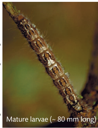
Mature larvae (~ 80 mm long)