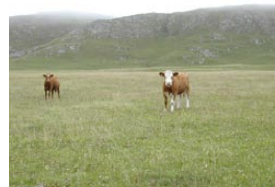
Cows in the Machair on Tiree

significantly as have associated species such as arable weeds and granivorous birds. Most notably, the corn bunting ( Miliaria calandra ) became extinct on the island in 2000, and although present on nearby islands is also declining there. Winter cattle feed has now to be imported from the mainland threatening sustainable cattle production and the use of grazing as a conservation tool on the Machair and Carex nigra heaths.