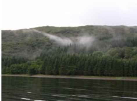
Camas Salach Atlantic oakwood on Loch Sunart

The combination of favourable climate and ecological continuity as woodland have resulted in some of the richest lower plant assemblages in Europe.