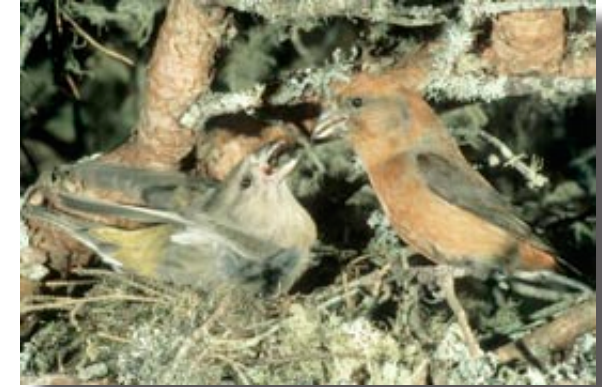
Pair of Scottish crossbills on nest

early spring. At the crossbill survey sites presence and coning of conifer species is also being recorded using a series of photographic conifer identification guides especially developed for this purpose.