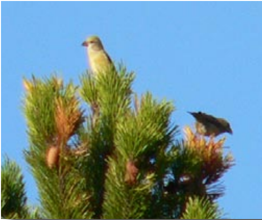
Crossbills feeding on pine cones up in the tree tops

The Scottish crossbill ( Loxia scotica ) is the UK's only endemic bird species and on the World Conservation Union's red list of threatened species. These birds depend on conifer woodlands and are thought to utilise a range of tree species. They feed on those that cone well and can switch between species as seed becomes available in maturing cones.