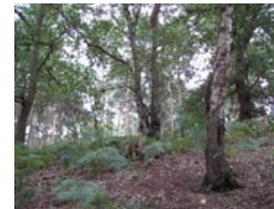
Woodland in central England

The biodiversity survey aims to develop European guidelines for forest biodiversity and suitable indicators. In co-operation with the Joint Research Centre of the European Commission, a stand structure approach was taken assuming greater biodiversity potential with increasing forest stand complexity: classification of each plot according to forest type, age, origin, composition, management and previous land-use ( BioSoil Forest Biodiversity Field Manual PDF-294K ).