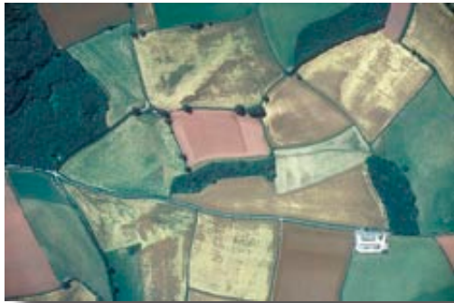
Aerial view of a fragmented landscape

Climate change is predicted to have a significant impact on biodiversity with many species being forced to adjust their range pole-wards and to higher elevations. This problem is compounded by habitat fragmentation as it may hinder this range adjustment.