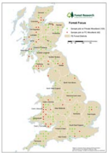
Forest Focus BioSoil plots in the UK

Forest Research is the UK partner of this international project which uses a survey network of 6000 sample plots across Europe. The network is based on a 16km x 16km trans-national grid and often includes the Level 1 plots of its 36 member states. The 167 BioSoil plots for the UK were installed in 2006 by Forest Research's Technical Services Unit in both private and public woodlands.