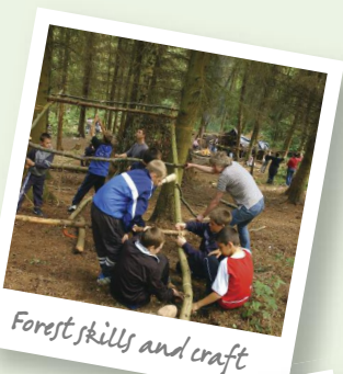
Forest skills and craft