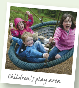
Children's play area