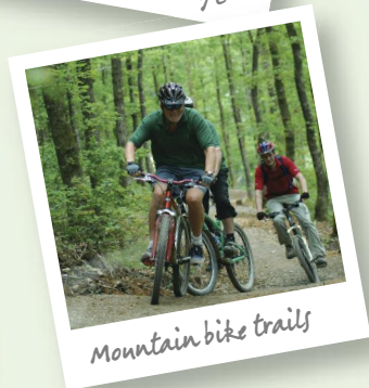
Mountain bike trails