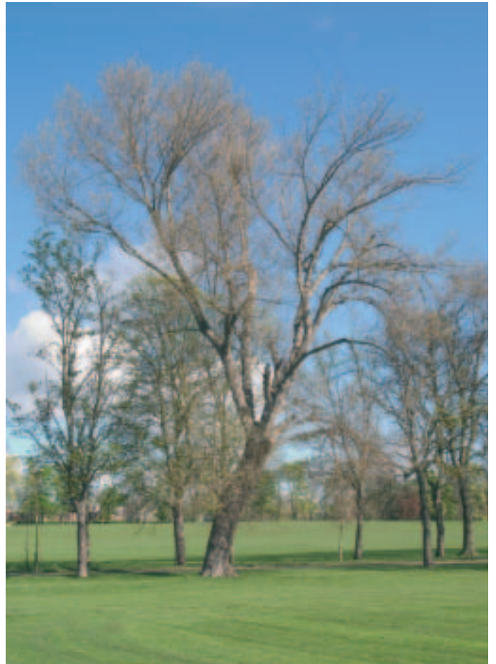
Figure 2 A specimen of an old black poplar tree.

The popularity of black poplar declined in the 19th century following the introduction of the faster growing hybrid between the American P. deltoides and the European P. nigra ( P. x euramericana ). Until recently, there had been very little planting of black poplar since this time and, as a result, the trees which remain today are old and are reaching the end of their lives (Figure 2).