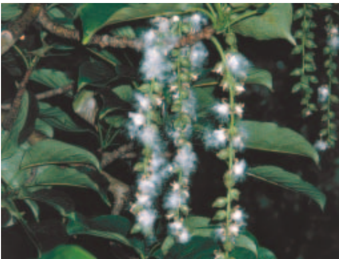
Figure 1 Female catkins with seed producing capsules.

The popularity of black poplar declined in the 19th century following the introduction of the faster growing hybrid between the American P. deltoides and the European P. nigra ( P. x euramericana ). Until recently, there had been very little planting of black poplar since this time and, as a result, the trees which remain today are old and are reaching the end of their lives (Figure 2).