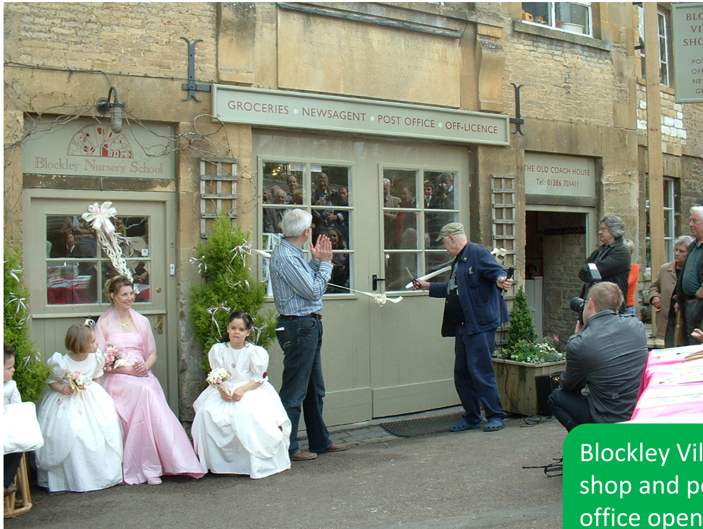
Blockley Village shop and post office opening. 2009