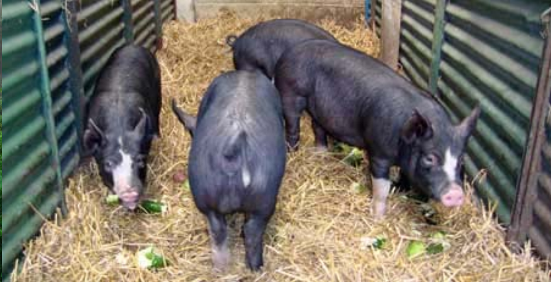
Wye Community Farm, Kent