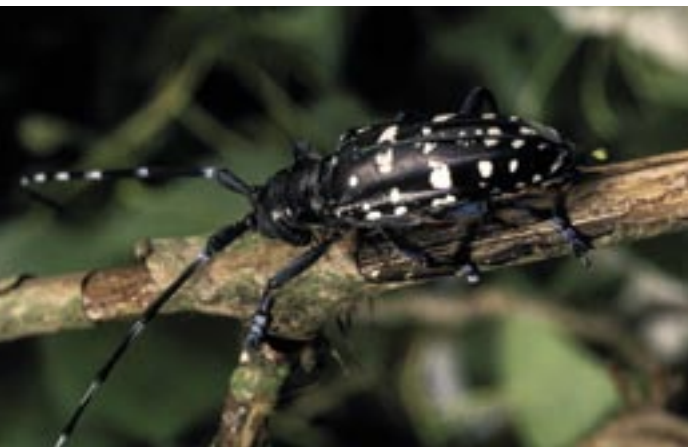
Above: Asian longhorn beetle