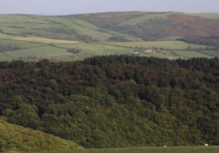
Above: Horner Woods, Exmoor, Somerset

Relevant areas for the woodland and forestry sector include: