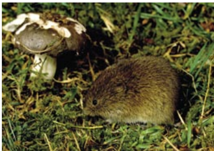
Above: Field Vole

It is likely that many mammals will benefit from both warmer winters and increased food supplies, two of the factors influencing their population. Deer, rabbits and voles are expected to benefit from the improved spring forage likely to be available and grey squirrels are likely to benefit from increased seed supplies in autumn. Owners should therefore keep protection measures 17,18,19 under review and adjust them as necessary to ensure that potentially damaging populations do not become established.