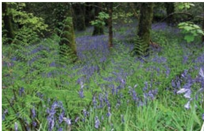
Above: Native woodland, North Cornwall

though extreme events like storms and droughts will be more frequent. Trees are generally robust and simply following good practice guidance will provide some resilience against climate change. However, some rare woodland species and/or those with poor powers of dispersal, particularly those found in ancient woodland, will be under pressure. There are some 'no-regret' or 'win-win' adaptive actions that could be implemented from now on – some are suggested in the following sections. It should however be borne in mind that decisions and actions made now must be appropriate to the climate of both the present and the future and that, where possible, it will be beneficial to keep options open for as long as possible.