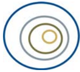
Figure 1: How the partnership will work