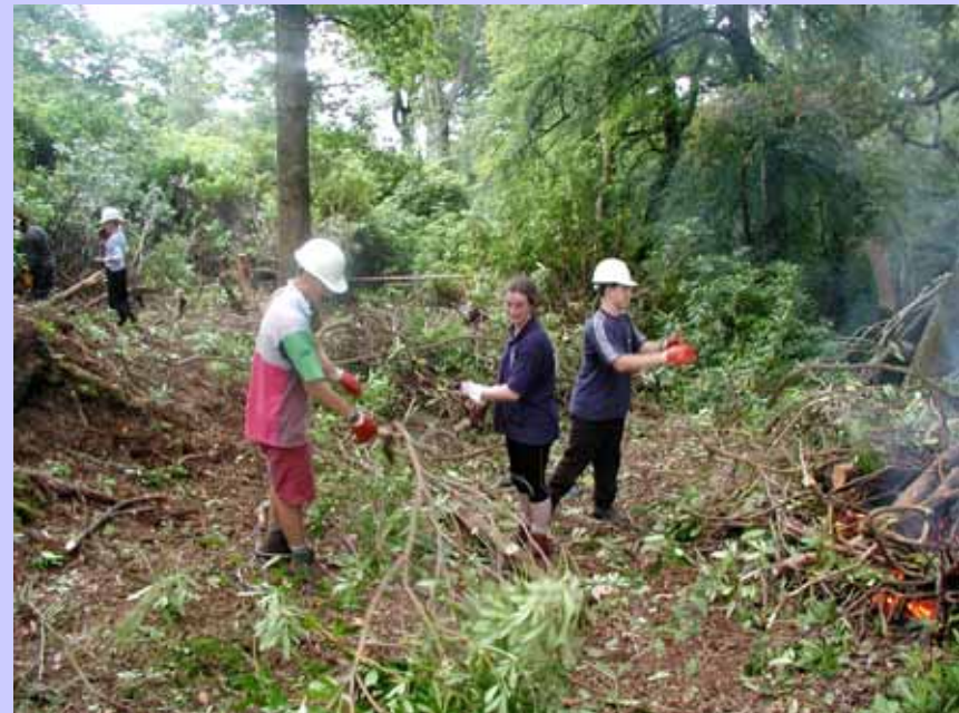
2005 NTS volunteers