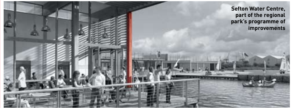
Sefton Water Centre, part of the regional park’s programme of improvements

One major scheme is an extension to the Leeds & Liverpool Canal, allowing canal boats to navigate to Liverpool’s waterfront. This could attract up to £3.3m in additional income and generate more than 170 new jobs. 4