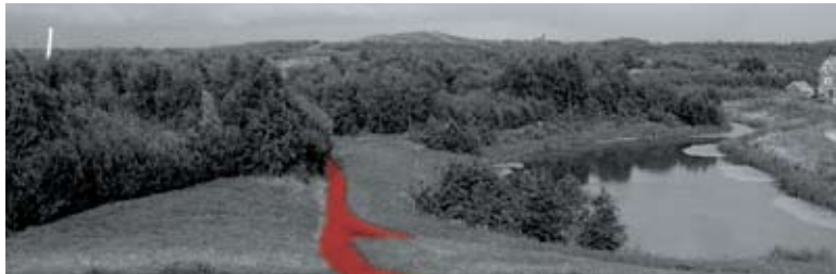
View from hill top at Colliers Moss, St Helens – it really is the 'town in the forest'

There is evidence, too, that land values are increasing as green infrastructure becomes a greater priority. At Bold Moss, the former Bold Colliery site, derelict industrial land has been transformed into a community woodland and nearly 600 new homes built. A report by the District Valuer found property values in the area had risen by £15m as a direct result, and new developments worth £75m had been attracted.