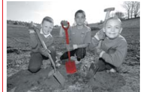
Local schoolchildren help to transform Moston Vale

Expected benefits include extra investment in a nearby business park and increased property values in the vicinity. 22 These values are being tracked through new research by the District Valuer for all Newlands sites.