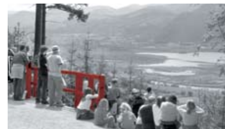
Left: Visitors gather at the Dodd Wood viewpoint.