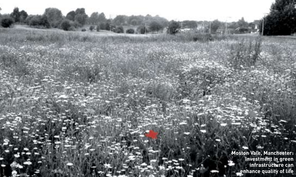
Moston Vale, Manchester: Investment in green infrastructure can enhance quality of life