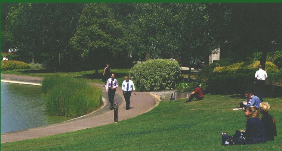
Communal green space in Stockley business park