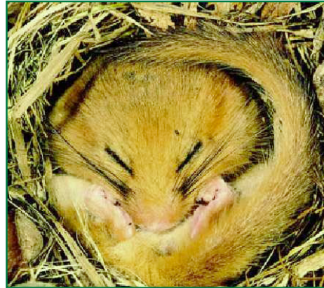
Above: Dormouse ( Muscardinus avellanarius )

The Archaeological and building surveys are currently being completed. All of these reports help us to understand the present condition of the site and are an essential process in the development of a design plan which is sensitive to the bio-diversity and historical significance of the site.