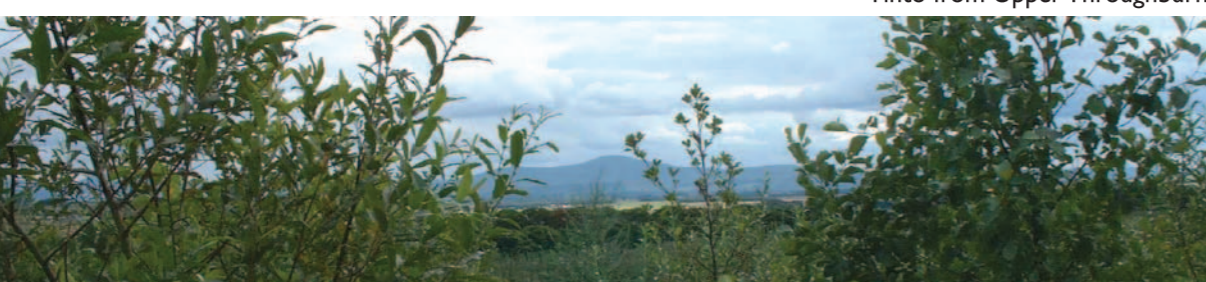
Tinto from Upper Throughburn