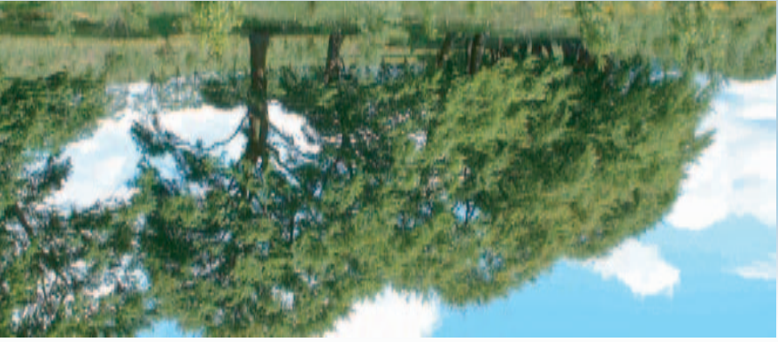
Heathland Loch, Heathland Forest