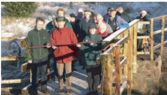
Members of the local community and the Forth Access Group open a new bridge, Wilsontown Ironworks, December 2002.

This map will help you explore the many tracks and trails around Forth.