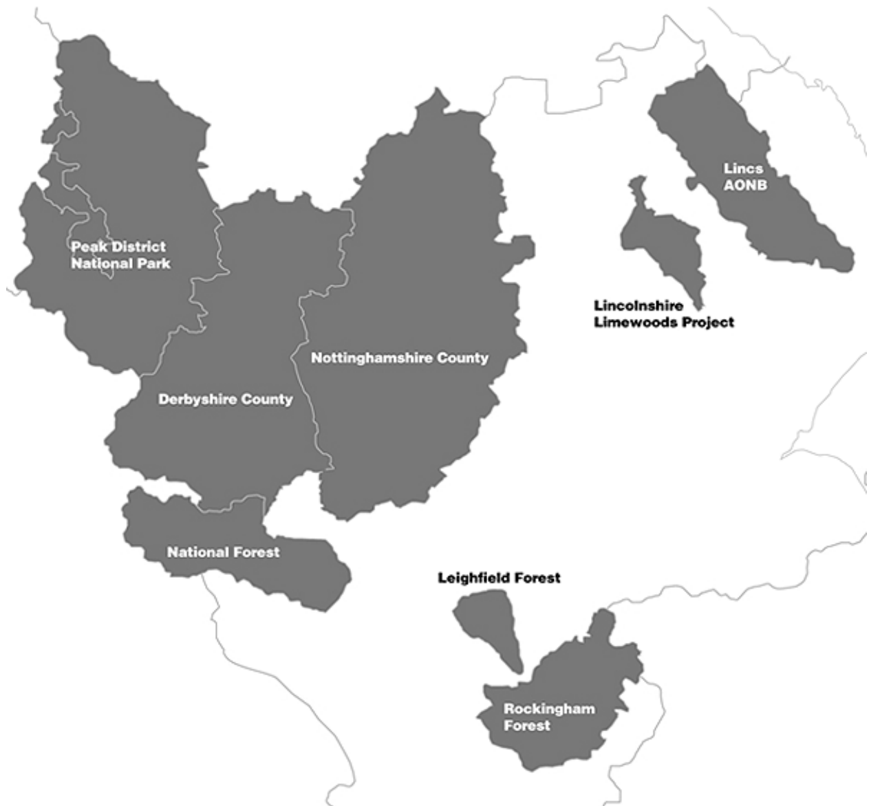
Figure 1 – East Midlands Woodland Bird Additional Contribution Priority Areas