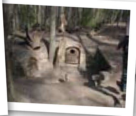
The Dwarves Forest (Tervete, Latvia). Adjoins the home of Anna Brigadere, a well-known children's author.