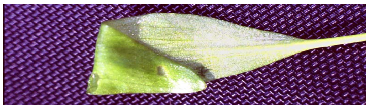
Figure 1: Leaf folded around a newt's egg.