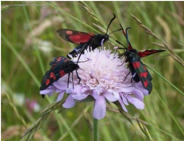
Above: Burnet Moths

We love receiving them, as it is always interesting for us to get a glimpse of Jeskyns through our visitor's eyes. They are also a great way of recording how Jeskyns is developing and changing with the seasons.