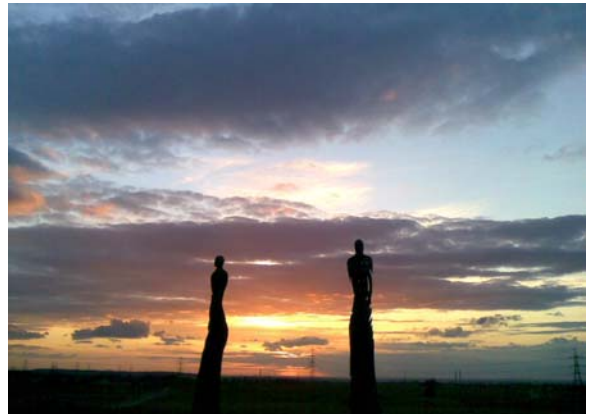
Above: Sunset

Many of you have found our cows and sheep at Jeskyns an inspiration for some great photos!