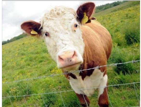
Above: Cow - by Ron Poulter

In the meantime, we have included some here in the newsletter to give you an idea of the types of great shots many of you are capturing.