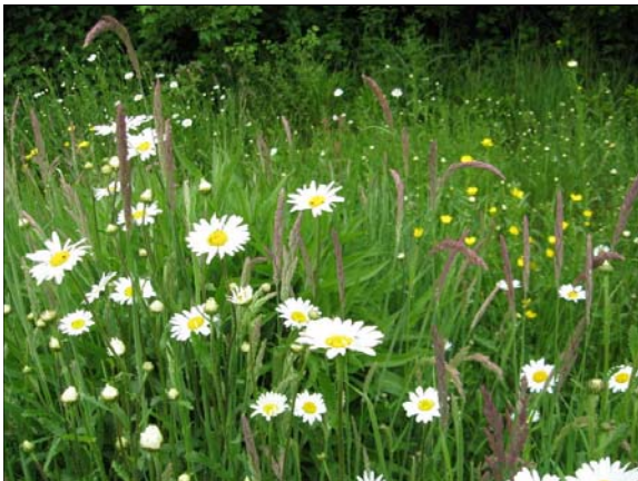
Above: Wildflowers

We have now devoted the reverse of our notice board in the car park as a Visitor Photo Gallery so that we can display as many as possible. So if you have a photo that you would like to share with others why not email it to us?